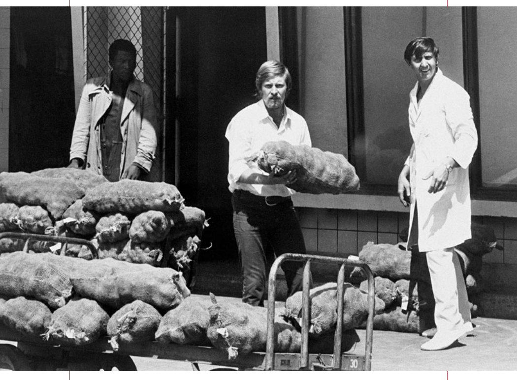
White supervisors undertake Black labourers' work in a market in January 1973.