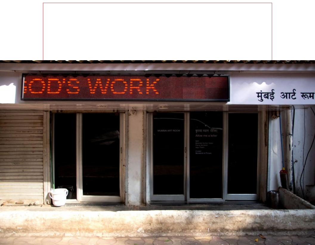
Birender Kumar Yadav, Government Work Is God's Work , 2017. LED light installation projected onto the entrance of the Mumbai Art Room.