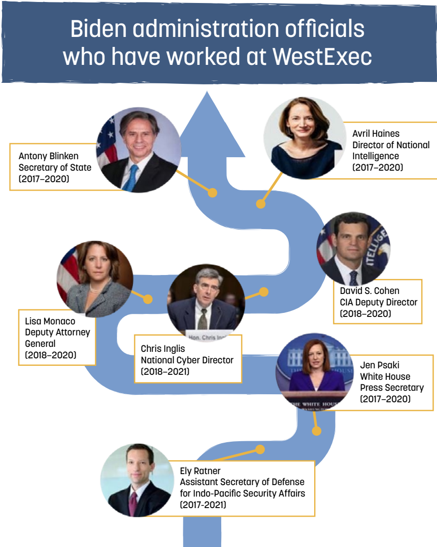
The WestExec to Biden administration pipeline, part one. 35