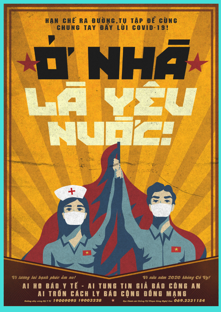
Ở nhà là yêu nước! ('To stay at home is to love your country!'), Vietnam, 2020. Hiep Le Duc