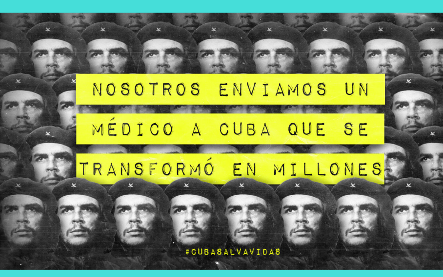
We sent a doctor to Cuba; the doctor transformed into millions, 2020. #CubaSayesLives