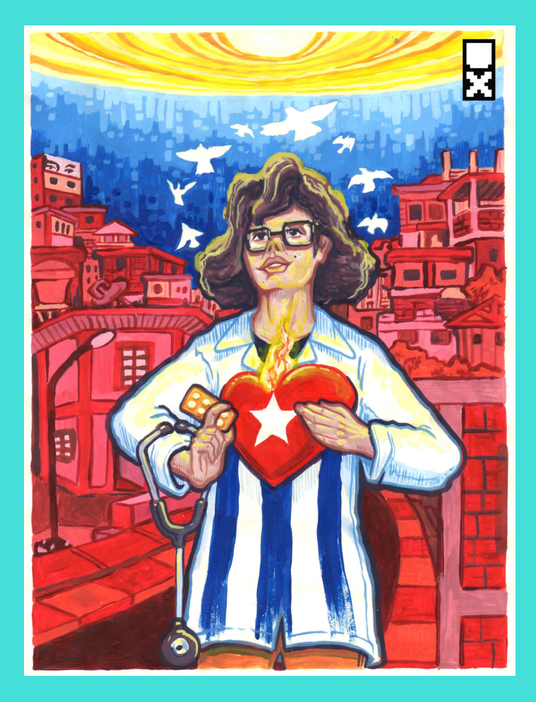
A los médicos cubanos ('To the Cuban Doctors'), Venezuela, 2020.