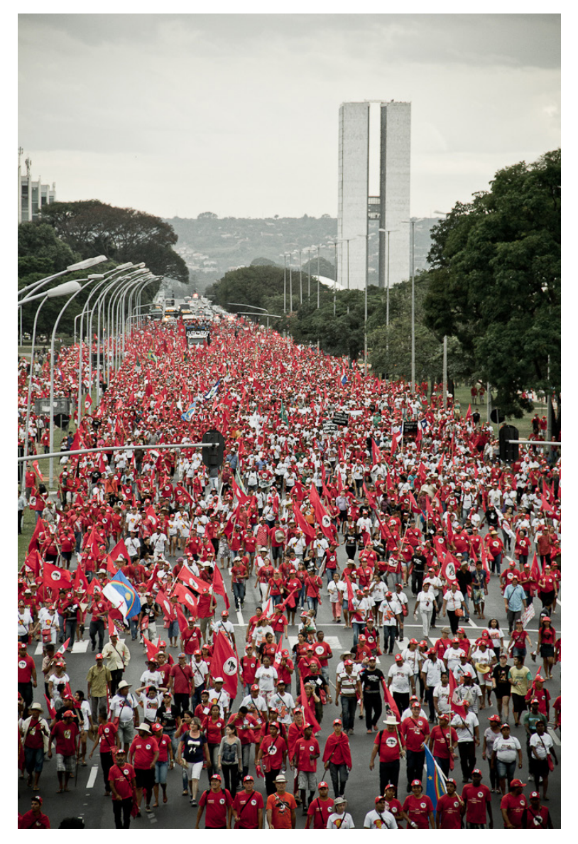
MST march that took place during the movement's 6th National Congress in 2014. The marches are among the movement's primary instruments of struggle.