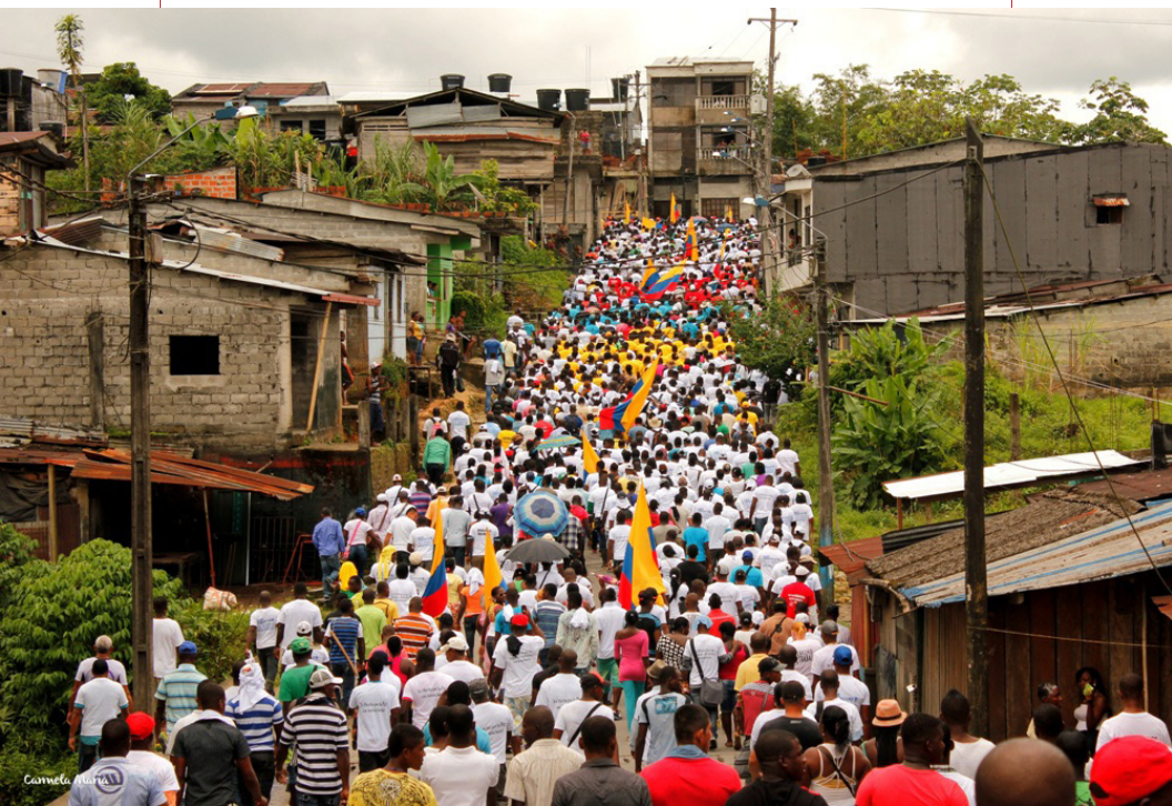
Mobilisation in the Department of Cauca. Peasant Association of Catatumbo – Ascamcat.