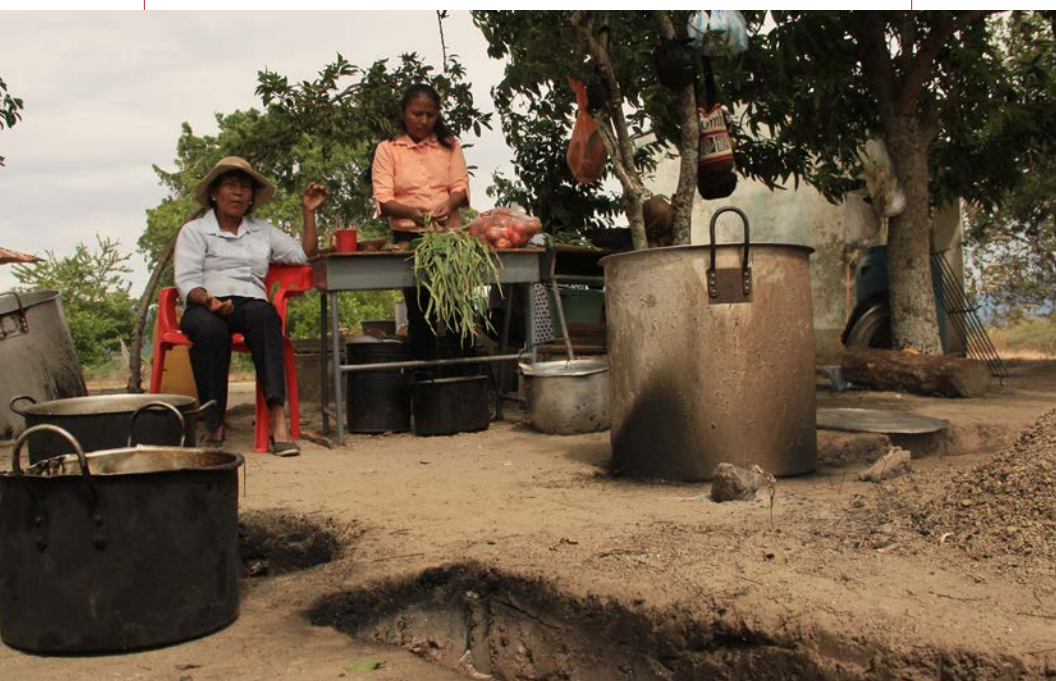
Mobilisation in Catatumbo, Department of North Santander. Peasant Association of Catatumbo – Ascamcat.