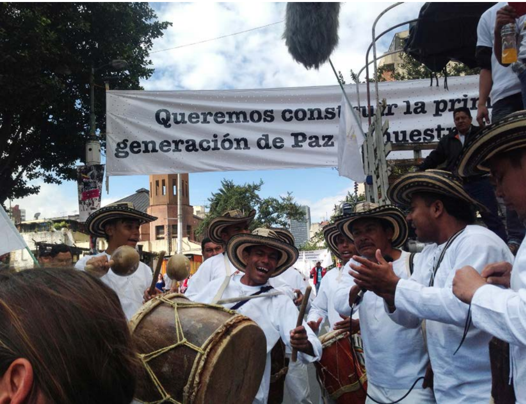
Mobilisation in Barranquilla, Department of Atlántico. Marcha Patriótica's communication team.