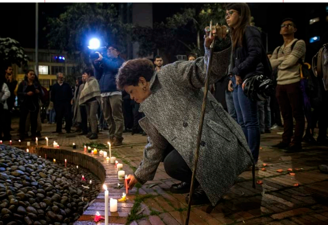
National mobilisation in support of the Peace Accord, November 2016, Bogotá D.C. Marcha Patriótica's communication team.