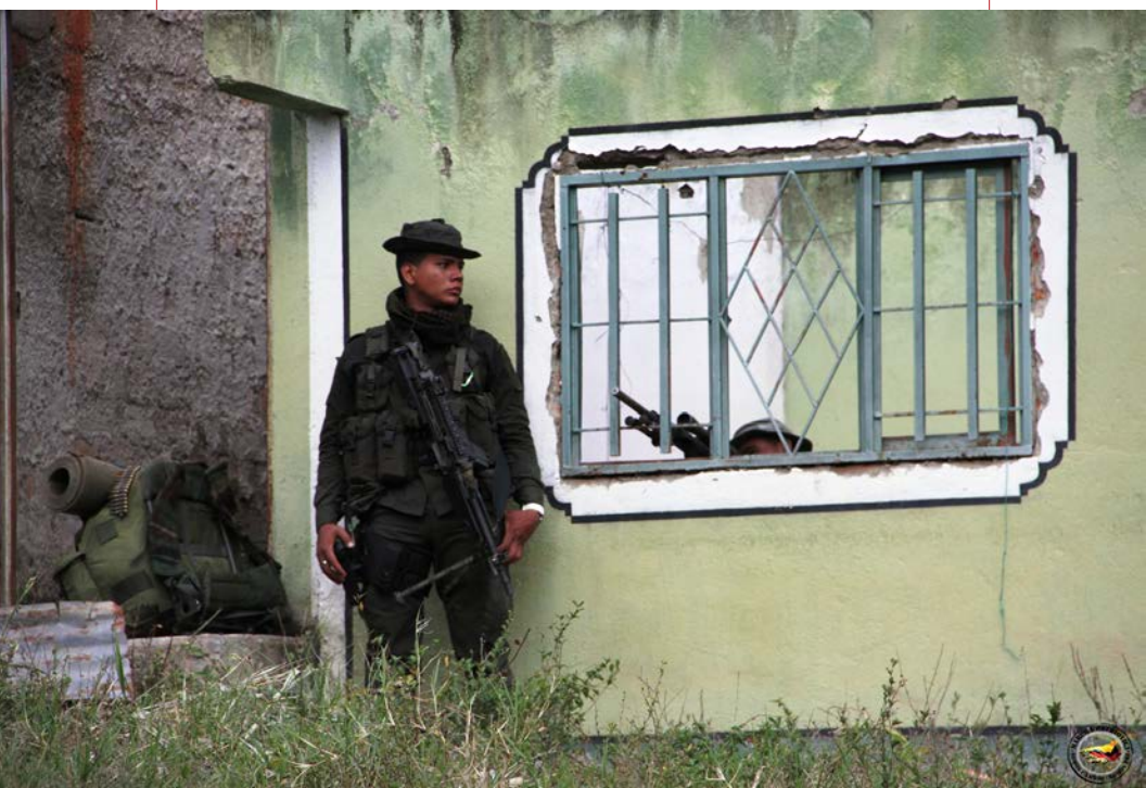
Village of El Mango, October 2015, Department of Cauca. Marcha Patriótica's communication team.