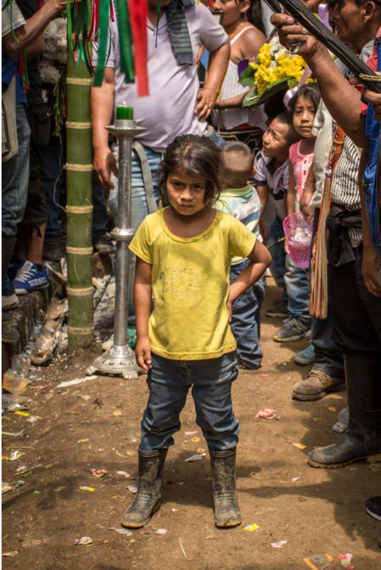
National Indigenous March, May 2016, Department of Cauca.