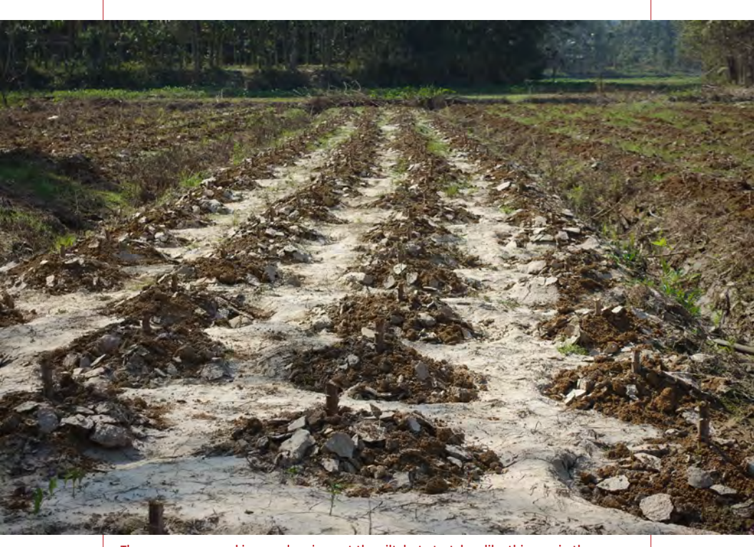
The women are working on cleaning out the silt, but stretches like this one in the middle of fields remain hardened and difficult to clear.