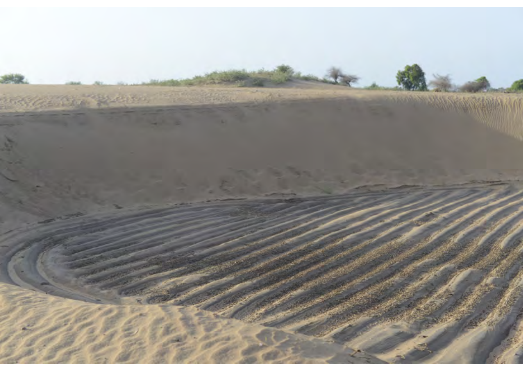
Honnureddy's painstakingly laid-out rows of plants were covered in sand in four days.

hope and possibility, and we learned how important land use, land ownership and control, and cropping patterns are in the pursuit of sustainable agriculture. The two stories that follow hopefully communicate something of that learning.