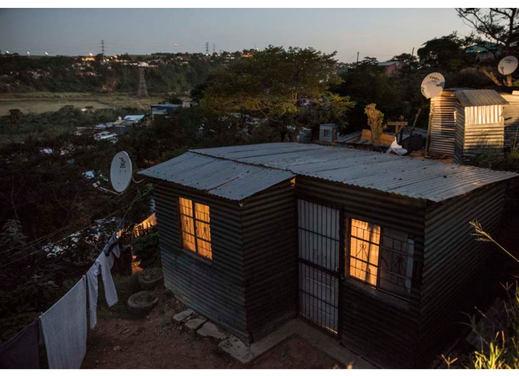
29 May 2018: Dusk at the Sisonke shack settlement in Lamontville, south of Durban.

I have always said that Abahlali is like the waves in the sea. Just as waves reject any trash you put in, Abahlali has always been able to toss out its trash. If the movement is infiltrated or if the leadership loses its way, then the membership acts to recover Abahlali from them. Our strong and committed membership has helped us when the forces that hate us try to destroy us.