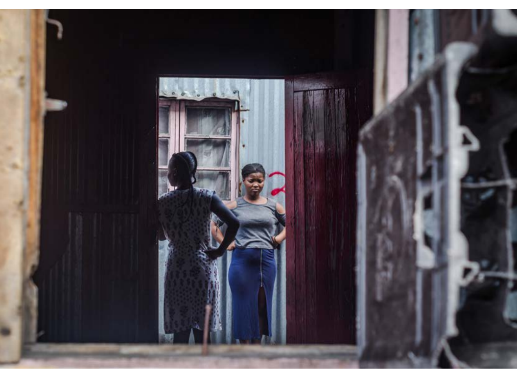
15 June 2018: Residents of the Lamontville Transit Camp being evicted by the City of eThekwini's Security Management Unit and the Department of Human Settlements, in Lamontville, South Durban.

miss the point. Judging people based on their socioeconomic status is always misleading. So that's what we teach the poor. To trust one another. You may not have money, but you are rich spiritually, and that makes you a better person. You are not corrupt. You are not going to lie. You are not going to make other people's lives miserable.