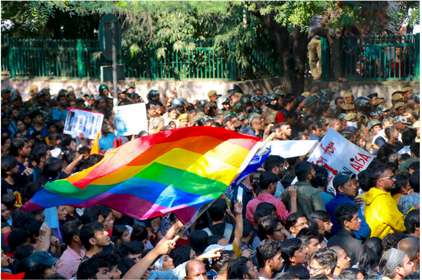
18 November 2019: Students carry an LGBTQ+ flag at a Fees Must Fall march to the Indian parliament in Delhi.