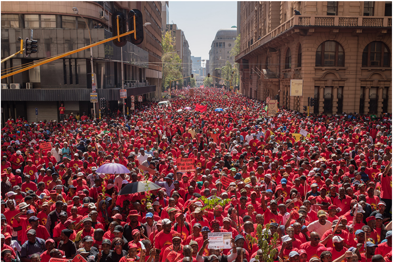
April 25, 2018: Thousands of SAFTU members stretch down Simmonds Street in central Johannesburg from outside the offices of the Gauteng Provincial government. The march was a part of SAFTU's national shutdown and protests against the proposed minimum wage of R20 an hour were held across South Africa.

Under the administration of Thabo Mbeki (1999-2008), the government was moving swiftly to use the State and parastatal organisations to uplift the lives of the black majority. However, kleptocracy has severely hampered the government's ability to drive societal change and be an engine of economic growth. The collapse in the government's credibility is so severe that even some trade unions now support privatisation.