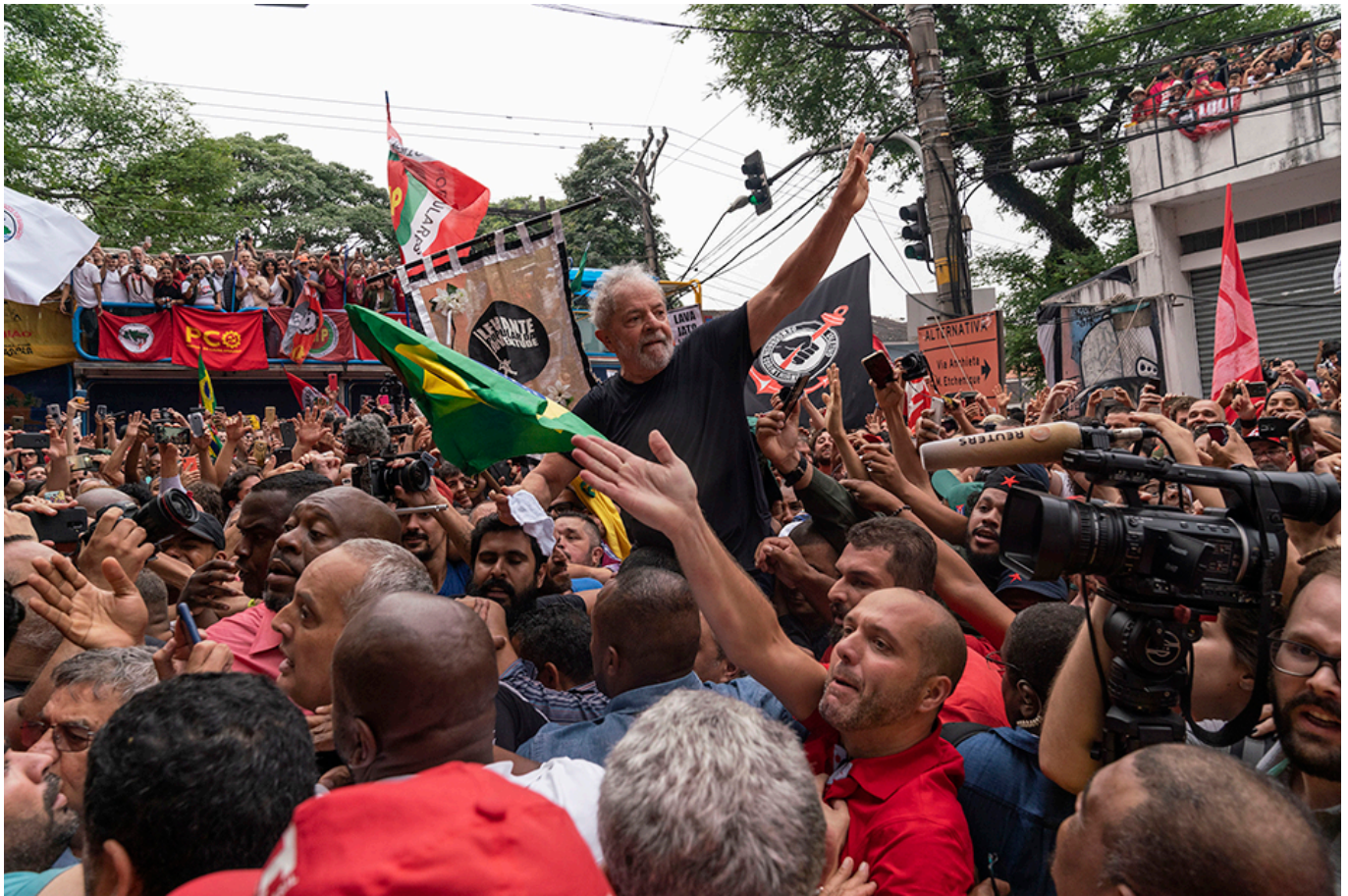
9 November 2019: Former Brazilian president Luiz Inacio Lula da Silva is carried on the shoulders of the crowd as he makes his way back to the entrance of the ABC Metalworkers Union headquarters in São Bernardo do Campo, in the south of São Paulo where a rally was held to celebrate Lula's release from prison.