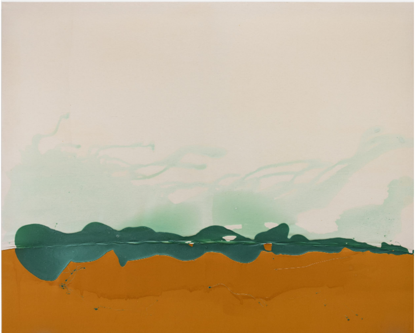
Buhlebezwe Siwani (South Africa), Mpuma koloni ('Eastern Colony'), 2022.

Greetings from the desk of Tricontinental Pan-Africa ,