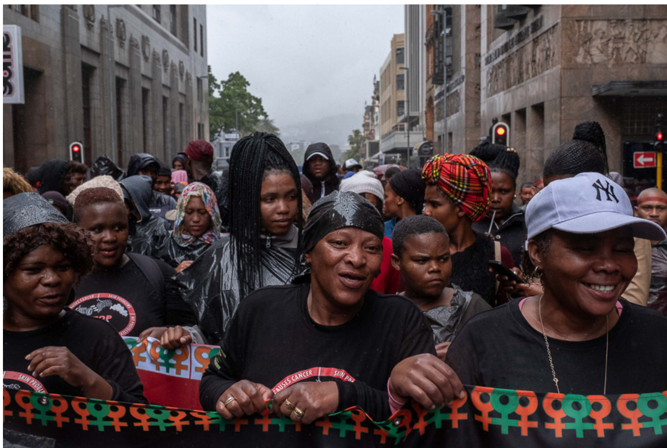
Members of the Commercial, Stevedoring, Agricultural, and Allied Workers' Union (CSAAWU) protest in Cape Town against poor working and living conditions on farms, 21 September 2019.