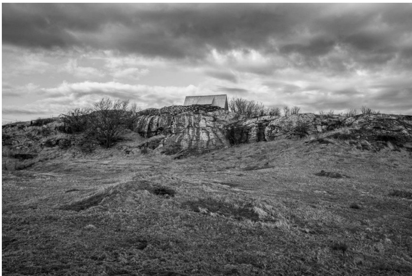
Mehrdad Afsari (Iran), Written Guidance , n.d.

This pattern is evident in the current conjuncture. In 2026, US President Donald Trump deepened or initiated five major conflicts on the planet. Three of them are being conducted alongside the government of Israel, which operates in a twinned manner with the United States government, with European countries providing diplomatic support and weaponry. Each of these wars violates the United Nations Charter, making them illegal acts that should receive condemnation at the UN Security Council; all of them are wars of aggression, which means that the person who authorised them is a war criminal.