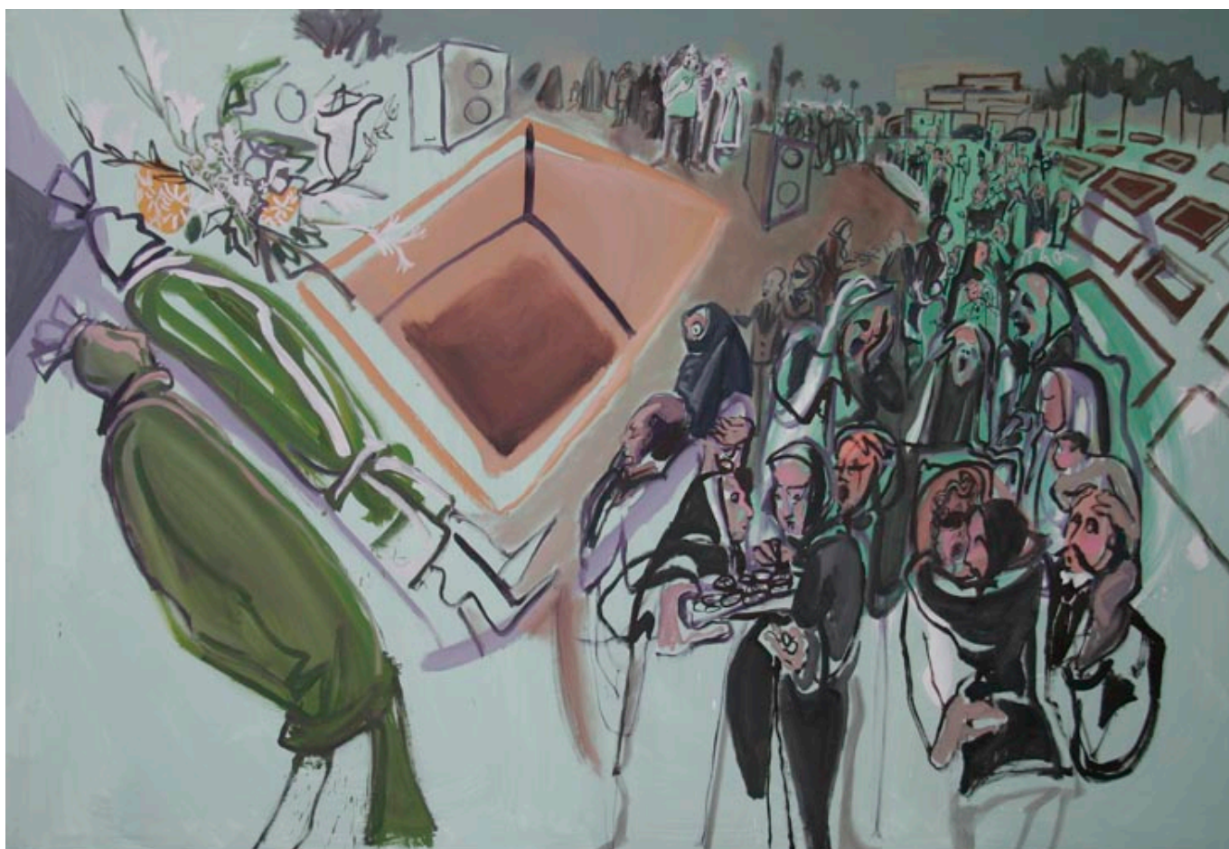
Rokni Haerizadeh (Iran), Typical Iranian Funeral , 2008.