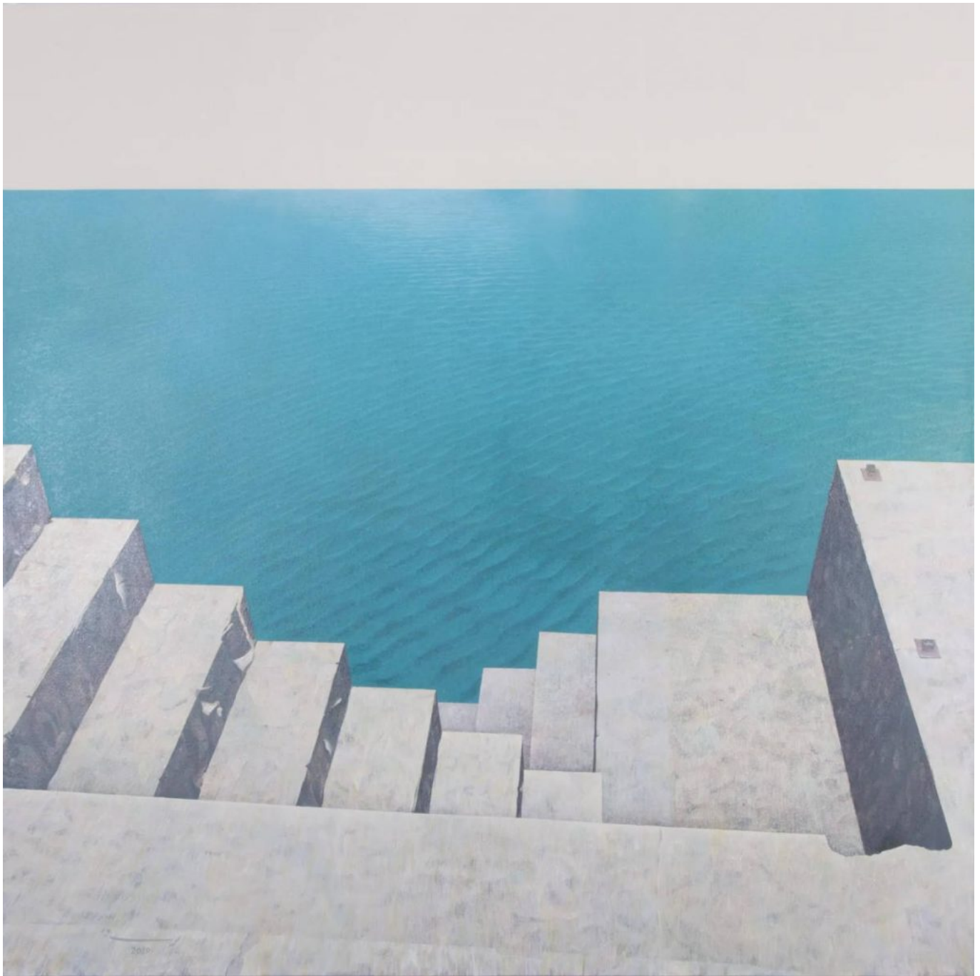
Meghdad Lorpour (Iran), Untitled , 2019.

These five wars are related to each other, being part of the US-driven imperialism that has begun to shape the planet (we are aware of other wars, in Myanmar, Sudan, and Ukraine, for example, but those will be for another statement). Unable to drive an agenda to recover its declined economic power and stop the rise of the Global South (particularly China), the United States has shifted its focus to its military force. But even here, the United States finds that it can destroy infrastructure and kill civilians, yet it cannot seem to subdue nations politically. Each of these countries stands tall. None of them are willing to surrender.