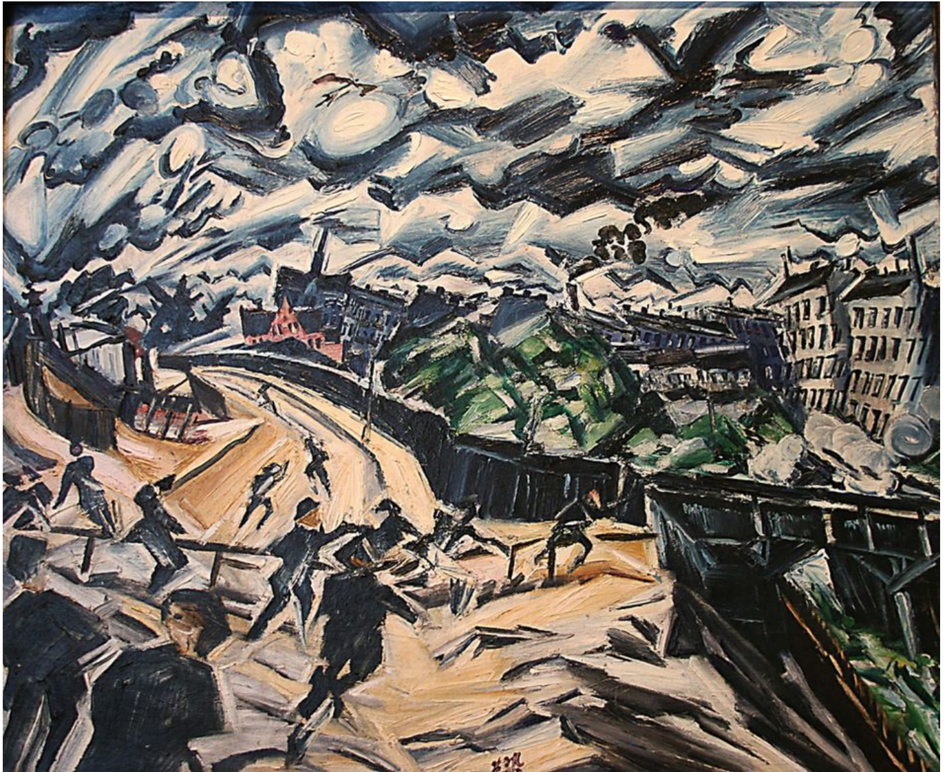
Ludwig Meidner (Germany), Apocalyptic Landscape , 1913.

The United States Is Waging a New Cold War is a chilling document, one that we hope will be read by concerned people around the world and help mobilise an urgent global peace campaign. Peace is essential, not the least in Ukraine. In the September/October issue of Foreign Affairs , Fiona Hill (former deputy assistant to President Donald Trump) and Professor Angela Stent wrote that in April, ‘Russian and Ukrainian negotiators appeared to have tentatively agreed to the outlines of a negotiated interim settlement’ where Russia would withdraw to the previous borders held before 23 February and Ukraine would promise not to seek NATO membership. However, in a move revealing of the West’s agenda, the UK prime minister at the time, Boris Johnson, arrived in Kyiv and urged Ukrainian President Volodymyr Zelensky to break off negotiations. Even if Ukraine was willing to sign a security agreement with Russia, Johnson said, the West