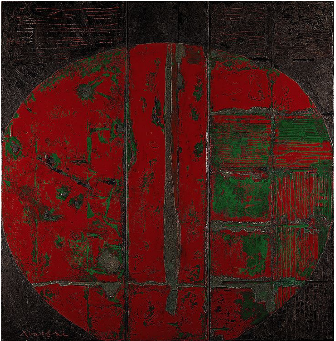
Su Xiaobai (China), Great Consummation-3 , 2008.

For the past fifteen years, the US has pushed its allies – including those organised in the North Atlantic Treaty Organisation (NATO) – to strengthen their military power while increasing its techno-military power and reach by establishing smaller bases across the world and producing new aircraft and ships with greater territorial reach. This military force was then used in a series of provocative actions against those it perceived as threats to its hegemony, with two key countries, China and Russia, facing the sharp edge of the US spear. At the two ends of Eurasia, the US began to provoke Russia through Ukraine and provoke China through