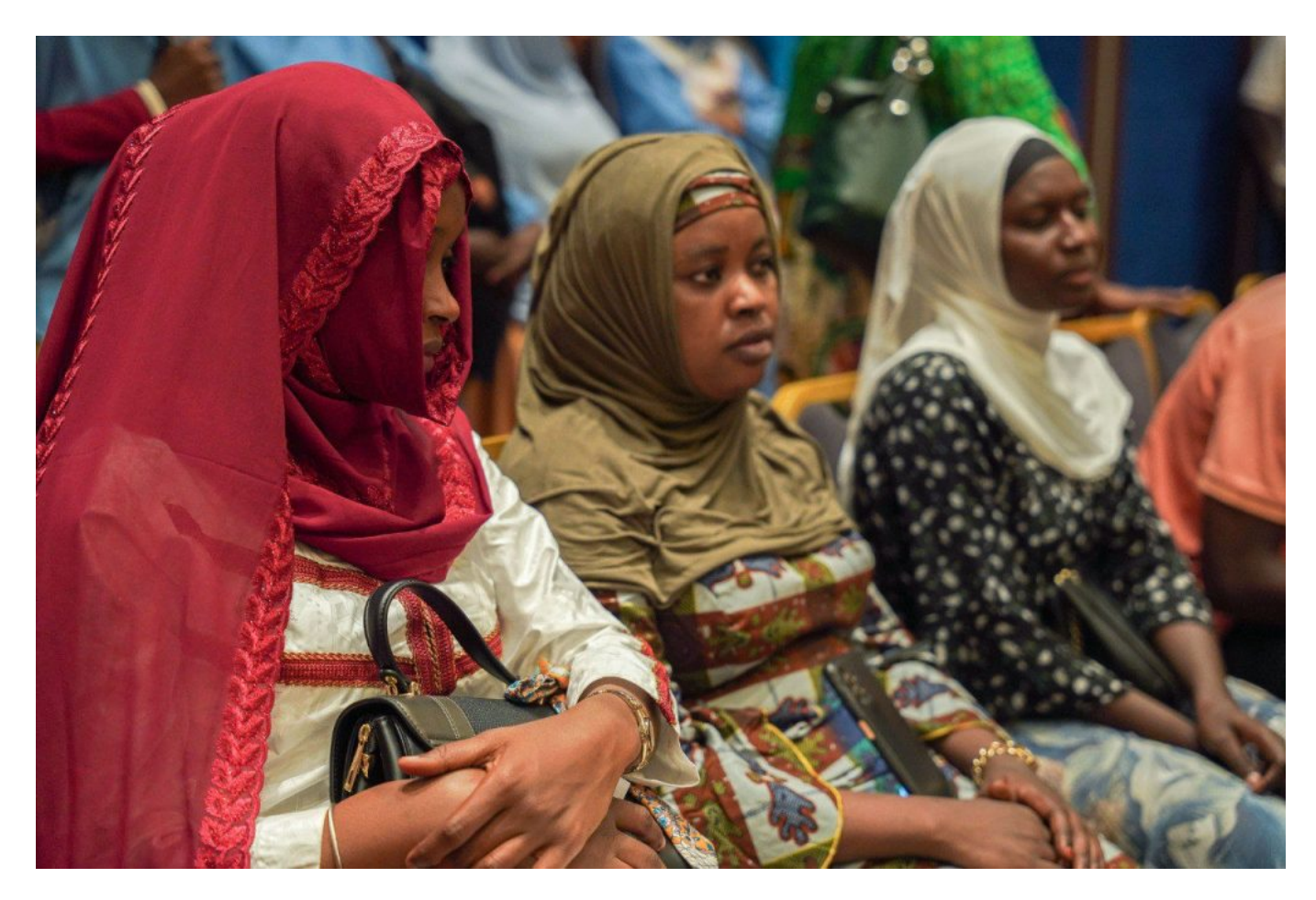
Conference in Solidarity with the Peoples of the Sahel, Niamey, Niger.

strides made by the government of Prime Minister Ali Lamine Zeine, a former minister of finance, but that the people must be vigilant and the government must be transparent.