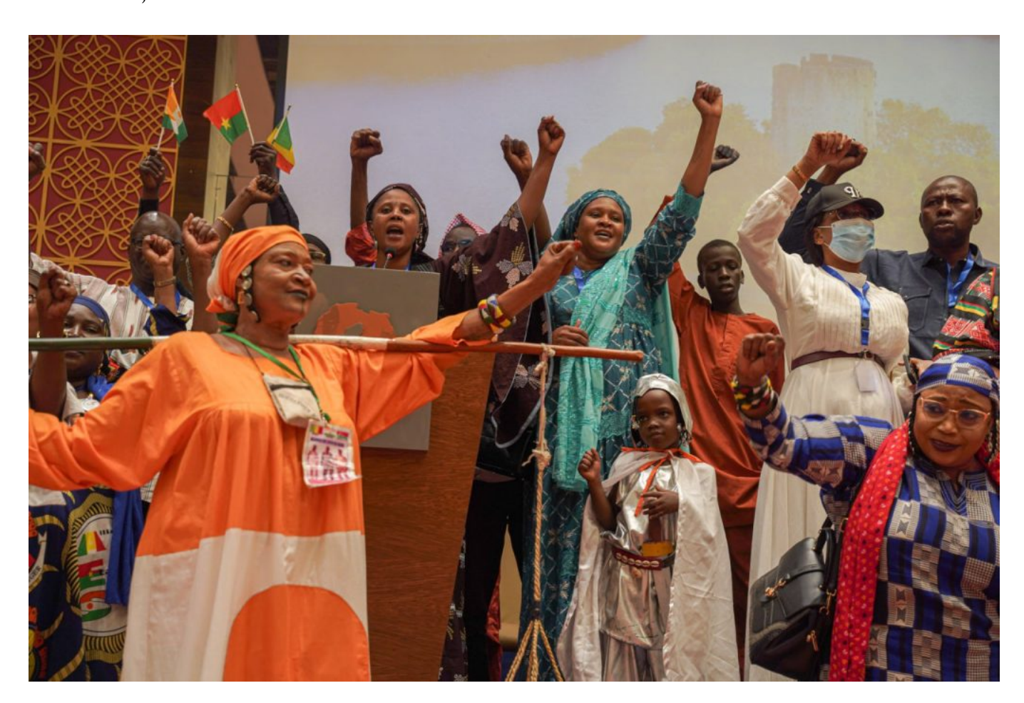
Conference in Solidarity with the Peoples of the Sahel, Niamey, Niger.

If people are not allowed to be 'themselves' or free, Fanon wrote around the same time, then they will rebel. 'The masses begin to sulk', he wrote in The Wretched of the Earth . 'They turn away from this nation in which they have been given no place and begin to lose interest in it'. The false nationalists, or flag nationalists, Fanon wrote, 'mobilise the people with slogans of independence, and for the rest leave it to future events'. Six decades later, we are now in the midst of these 'future events'.