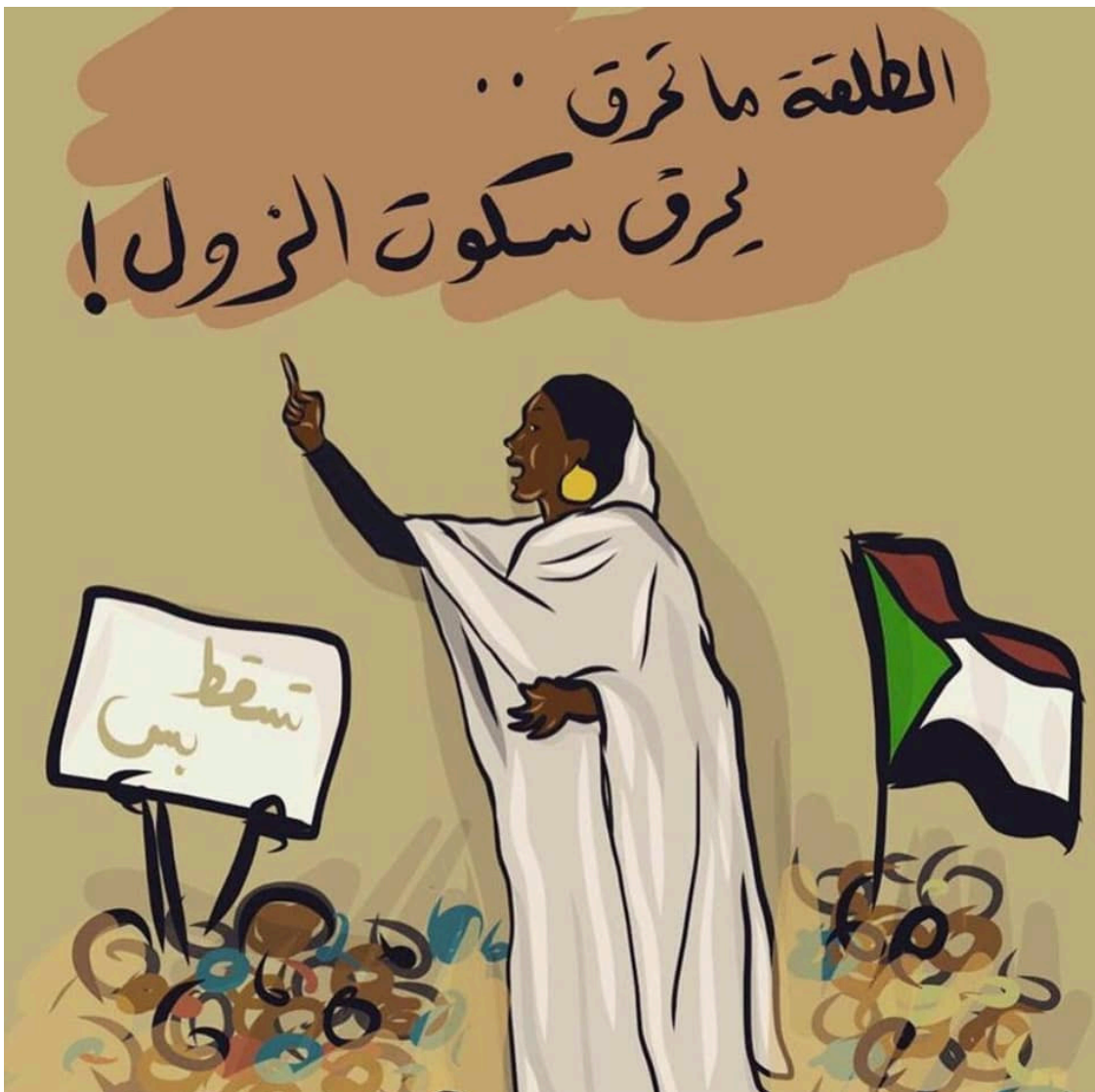
Bullets Don't Hurt. The Silence of the People Does. Khartoum, Sudan, 2019.

That old saw reasserts itself: they are not ready for democracy . The West and the Gulf Arabs back the old general Khalifa Haftar, as his forces slowly take control of all of Libya (see my column ). He sees himself as the mirror image of Egypt's strongman, Abdel Fattah el-Sisi. Morocco's courts sent the rebels of the Rif's Hirak movement into the king's dungeons. Algeria changed one leader for another, keeping the Pouvoir unchanged. This name – Pouvoir or Power – is an elegant one for what it describes. It suggests that these countries need strong, authoritarian leadership and not democracy. Here is the deep cultural conceit, the view that democracy cannot thrive everywhere. It is one more of those ideas that needs to be confronted ideologically and practically. This shallow view must be confronted with the long history of struggle in North Africa for full emancipation – a struggle that takes place in the Rif War of Morocco in the 1920s and extends to the cascading strikes in the textile factories of Egypt's el-Mahalla el-Kubra. Each of these expressions of democracy are crushed – often with the full support of the people who say that North Africans are not ready for democracy. And yet, in Sudan, massive public protest forced the military to eject Omar Bashir. The status of the politics of Sudan remains unclear.