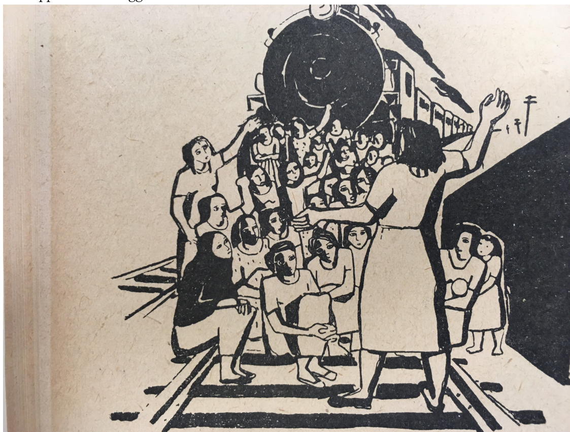
Brazil Women's Federation, woodcut 1950s.

Tolstoy's novel could not solve the problem for Maslova. But the novel brought inhumanity to the surface. That is, in broad terms, the purpose of art. Art does not change the world by itself. Reading a novel or looking at a design can draw our attention to problems and can even provide an understanding of them. But it cannot by itself change the world. Art and literature alert us to the contradictions in our world, show us how these contradictions – such as of Maslova's imprisonment – cannot be overcome by good, liberal feelings. Struggles are needed. Nekhlyudov knows that. The prisons uphold 'class interests', he says, referring to the interests of the class of the aristocracy and the industrialists. The interests of other classes – of the workers, such as Maslova – were suppressed. Art revealed the suppression. Struggle would take that revelation further.