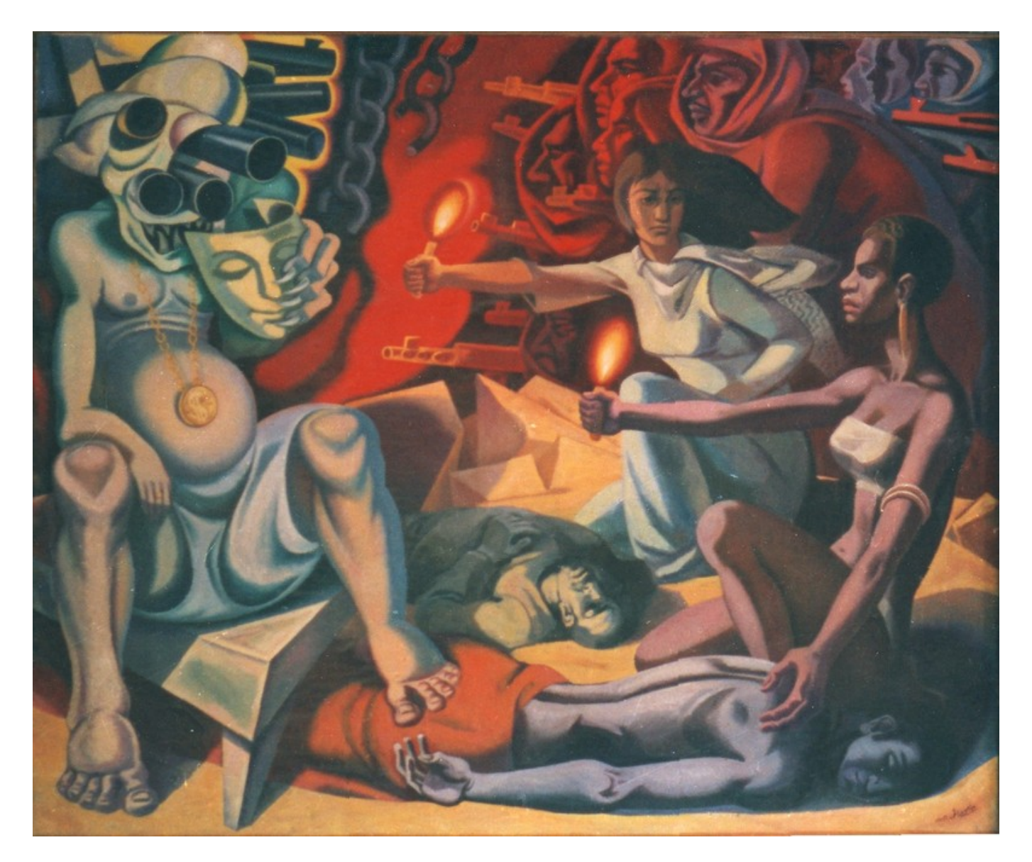
Mahoud Ahmad (Iraq), Title Not Known (Ahmad 9), 1976.

The statement about arms merchants is not made idly. According to a December 2024 fact sheet from the Stockholm International Peace Research Institute (SIPRI), the world's top 100 largest arms-producing and military services companies increased their combined arms revenues by 4.2% in 2023, reaching a staggering $632 billion. Five US-based companies accounted for nearly a third of these revenues. These 100 companies increased their total arms revenues by 19% between 2015 and 2023. Though the full numbers for 2024 are not yet available, if one looks at the quarterly filings from the main merchants of death, their earnings have spiked even further. Billions for warmongers, but nothing for children who are born into warzones.