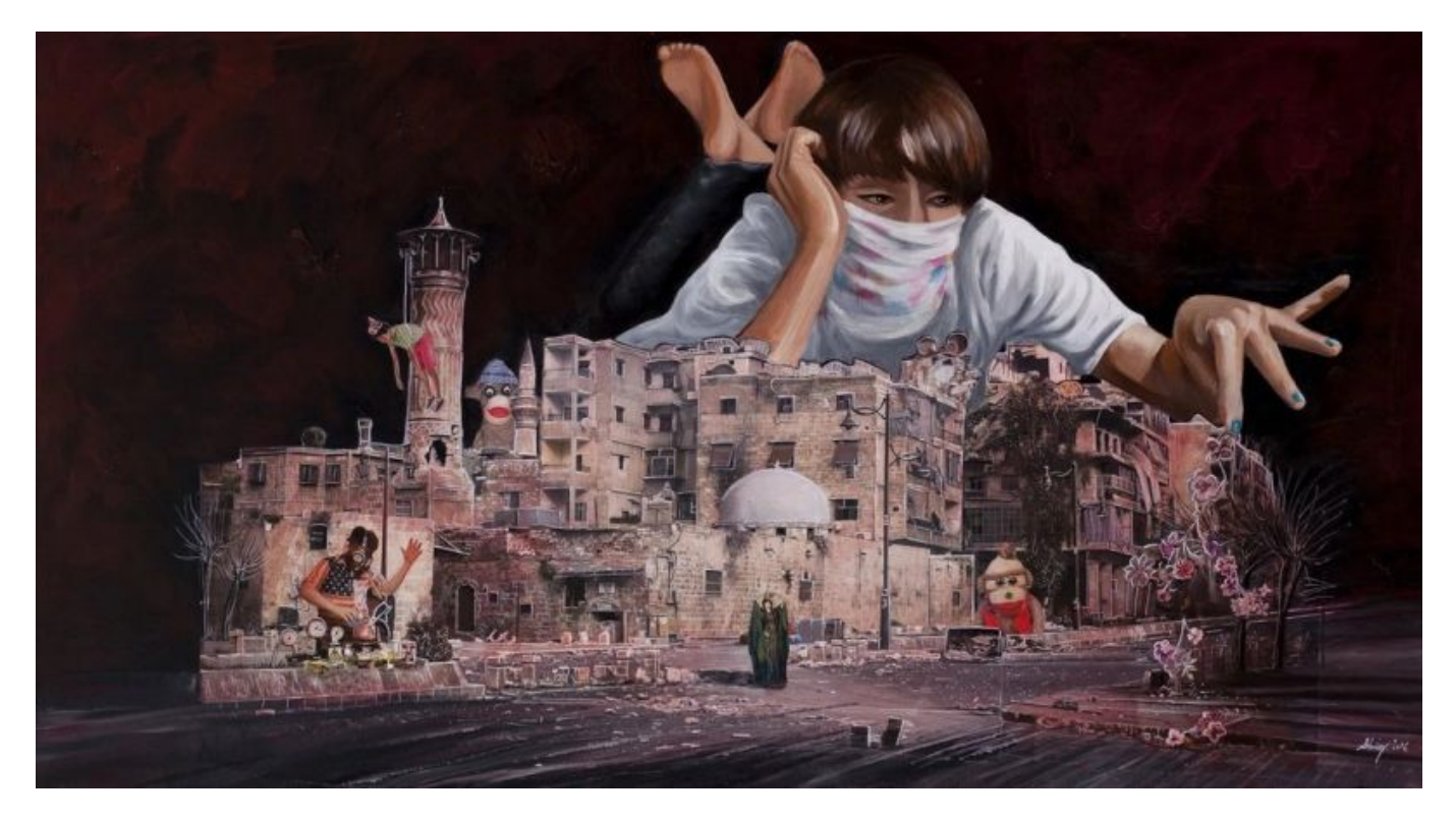
Shurooq Amin (Kuwait), The Moving Dollhouse, 2016.

Two days before the UN Security Council meeting, on 24 July, Israeli Prime Minister Benjamin Netanyahu addressed both chambers of the US Congress. Two months before this appearance, the International Criminal Court (ICC) said it had 'reasonable grounds to believe' that Netanyahu bears 'criminal responsibility for... war crimes and crimes against humanity'. This judgement was utterly set aside by elected US representatives, who welcomed Netanyahu as if he were a conquering hero. Netanyahu's language was chilling: 'give us the tools faster, and we'll finish the job faster'. What is the 'job' that Netanyahu wants the Israeli military to finish? In January, the International Court of Justice reported a 'plausible claim of genocidal acts' by the Israeli army. So, is the 'job' that Israel wants to complete its genocide of the Palestinian people, accelerated by the increased provision of arms and funding by the US?