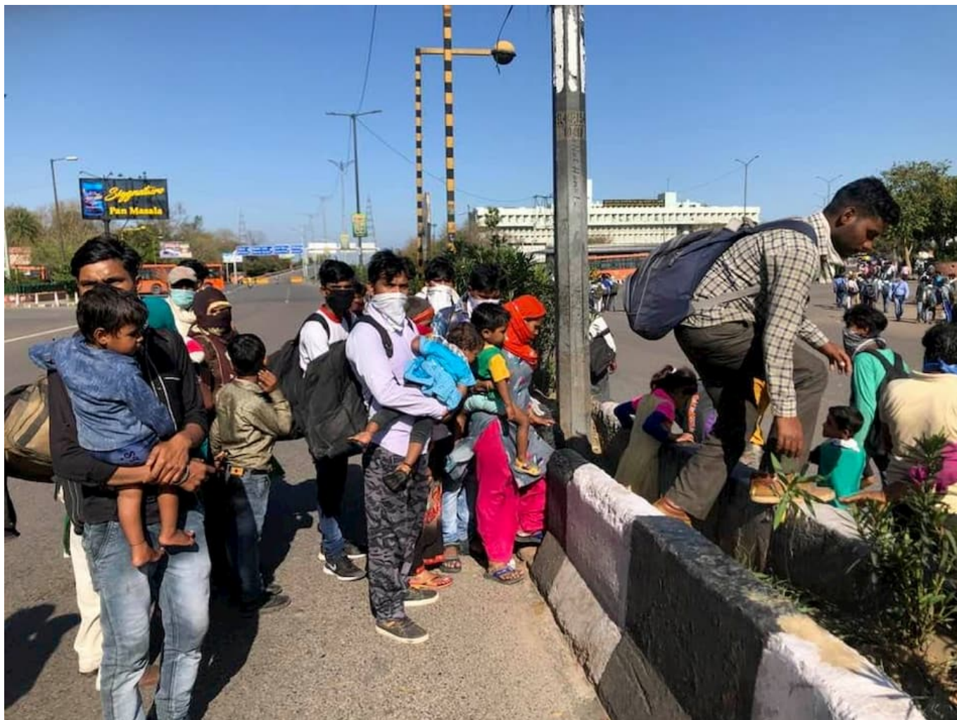
Workers near Kashmere Gate Inter-State Bus Terminal, Delhi, 28 March 2020.

The display of disparities condenses at the Anand Vihar bus terminal in Delhi (India), where thousands of factory workers and service sector workers stood cheek-by-jowl as the country closed down. P. Sainath, our Senior Fellow, writes that ‘the only transportation now available’ to the working class is ‘their own feet. Some are cycling home. Several find themselves stranded midway when trains, buses, and vans stop functioning. It’s scary, the kind of hell that might break loose if this intensifies. Imagine large groups walking home, from cities in Gujarat to villages in Rajasthan; from Hyderabad to far-flung villages of Telangana and Andhra Pradesh; from Delhi to places in Uttar Pradesh, even Bihar; from Mumbai to no-one-knows-how-many destinations. If they receive no succour, their rapidly diminishing access to food and water could trigger a catastrophe. They might fall to age-old diseases like diarrhoea, cholera, and others’.