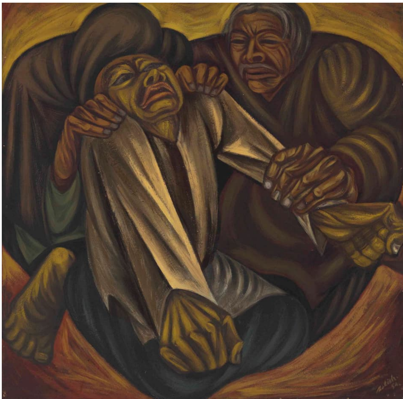
Satish Gujral (1925-2020), The Despair , 1954.

The International Labour Organisation (ILO) estimates that at least 25 million people across the world will lose their jobs due to the coronavirus, and that they will lose income worth about $3.4 trillion. But, as the ILO's Director-General Guy Ryder correctly said , 'it is already becoming clear that these numbers may underestimate the magnitude of the impact'. There were already 71 million displaced people before the CoronaShock – one person displaced every two seconds. Numbers are bewilderingly difficult to estimate – how many people will lose everything, with nothing from any of these 'stimulus packages' trickling down to them? These enormous infusions of trillions of dollars trickle down from central banks into the coffers of