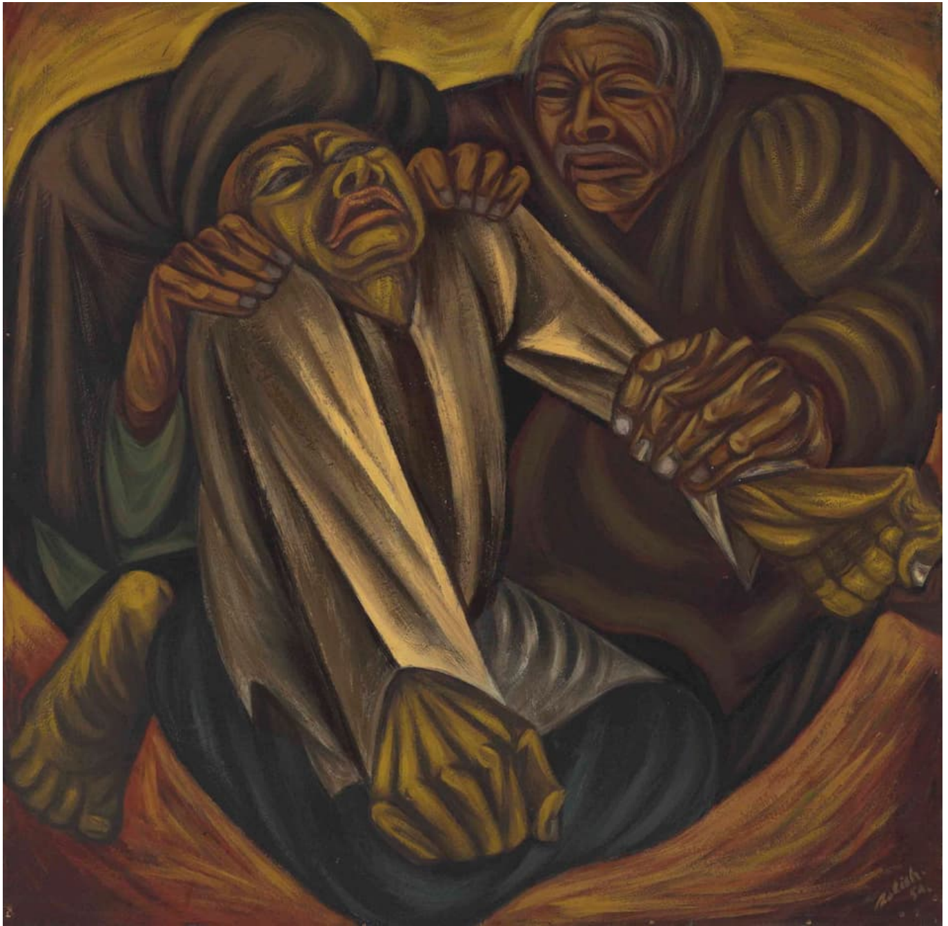
Satish Gujral (1925-2020), The Despair , 1954.

The International Labour Organisation (ILO) estimates that at least 25 million people across the world will lose their jobs due to the coronavirus, and that they will lose income worth about $3.4 trillion. But, as the ILO's Director-General Guy Ryder correctly said , 'it is already becoming clear that these numbers may underestimate the magnitude of the impact'. There were already 71 million displaced people before the CoronaShock - one person displaced every two seconds.