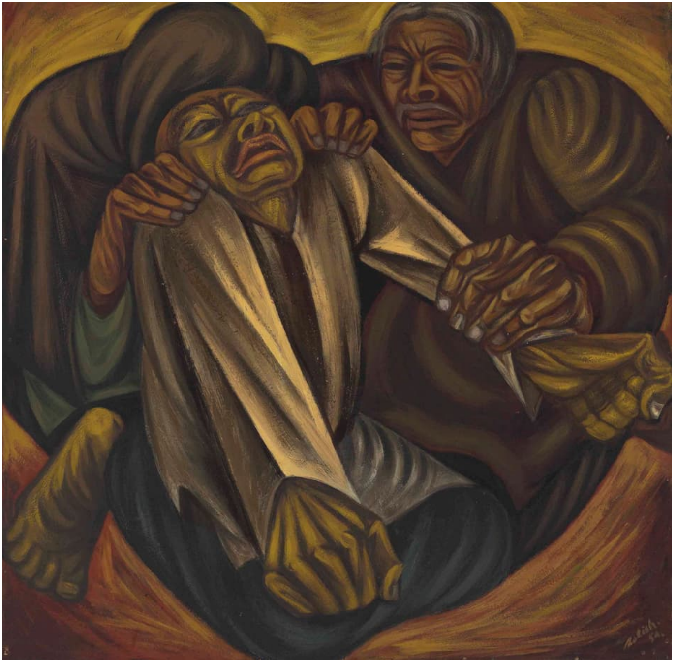
Satish Gujral (1925-2020), The Despair , 1954.

The International Labour Organisation (ILO) estimates that at least 25 million people across the world will lose their jobs due to the coronavirus, and that they will lose income worth about $3.4 trillion. But, as the ILO's Director-General Guy Ryder correctly said , 'it is already becoming clear that these numbers may underestimate the magnitude of the impact'. There were already 71 million displaced people before the CoronaShock – one person displaced every two seconds. Numbers are bewilderingly difficult to estimate – how many people will lose everything, with nothing from any of these 'stimulus packages' trickling down to them? These enormous infusions of trillions of dollars trickle down from central banks into the coffers of