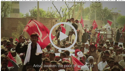
Laal, Farman-e-Khuda (2010).

Our friends in the Pakistani band Laal sang a lovely version of this poem during the Anjuman Muzareen (Tenant Association) March for land rights in 2010. You can watch it below.