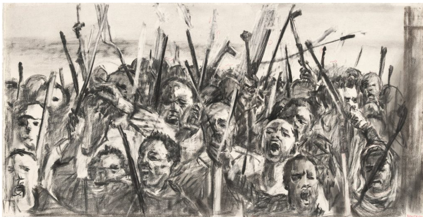
William Kentridge (South Africa), Drawing from the film Other Faces , 2011.

In 1982, the South African freedom fighter and poet Mongane Wally Serote (born in 1944), who lived in Botswana and worked with the Medu Art Ensemble (about which we wrote a dossier last year), published ‘Time has run out’ in his epic book The Night Keeps Winking . ‘[M]any of us have gone mad’, he wrote, because ‘we are human and this is our land’. Serote was writing of South Africa, but we can expand his vision now to Palestine, and indeed to the entire earth. And then Serote writes: