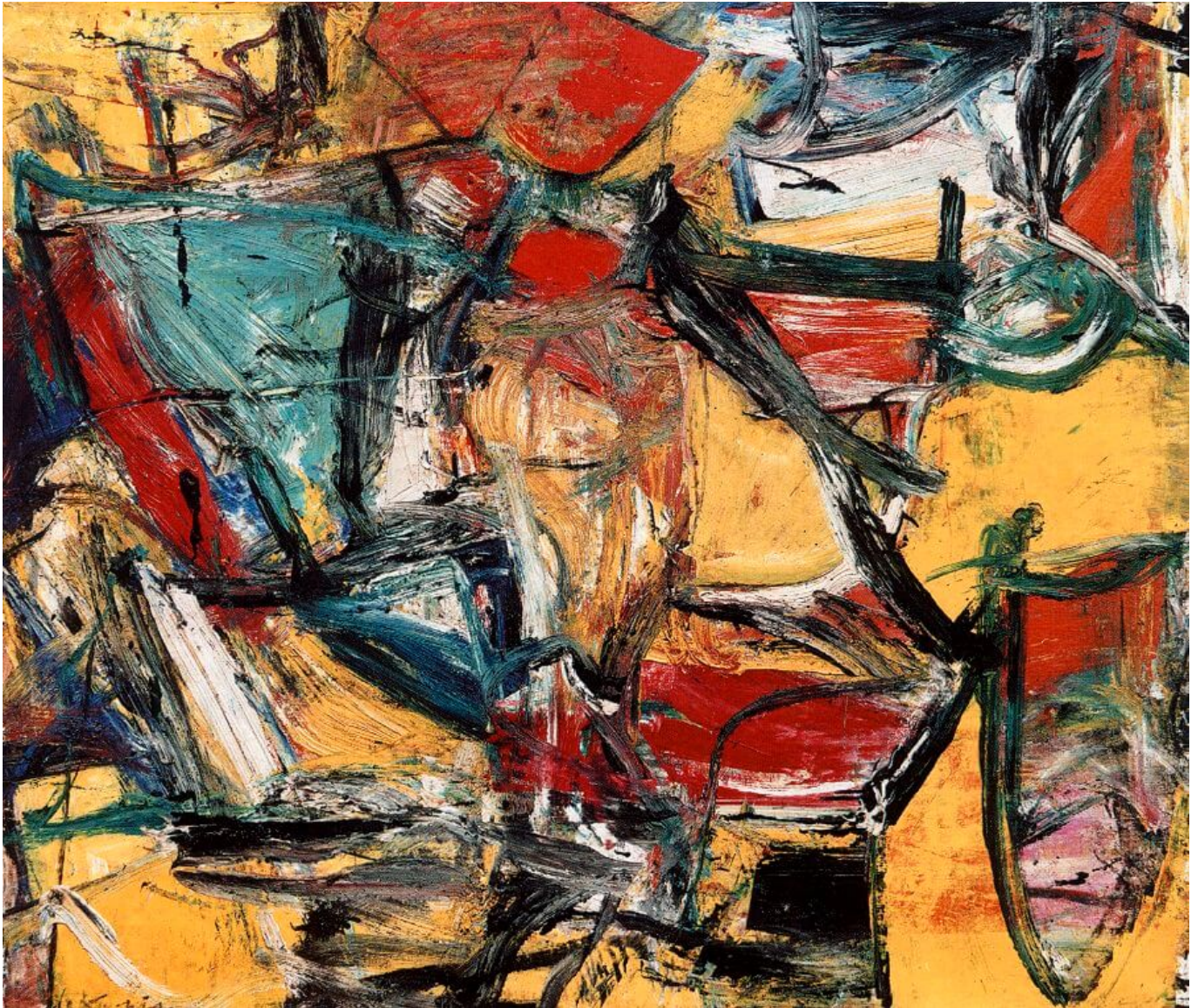
Willem de Kooning (Netherlands), Police Gazette , 1955.

Indices, such as the one from Freedom House, are not as innocent as they may appear. The design of the index – built on the subjective assessments of analysts and advisors selected from the world of Western establishment think tanks – produces outcomes that are often prescribed. While Freedom House claims to draw from the International Covenant on Civil and Political Rights (1966), it ignores the International Covenant on Economic, Social and Cultural Rights (1966). The latter would necessitate understanding democracy in a far more capacious way than the mere holding of elections and existence of multiple political parties. Article 11 of the second covenant, alone, would expand the idea of democracy to include the right to housing and the right to be free from hunger. As Article 4 notes, the purpose of the Covenant on Economic, Social and Cultural Rights is to promote ‘the general welfare in a democratic society’. Democracy here is used with the broadest understanding, extending far beyond simple electoralism. And even with regard to electoralism, there is scant concern in the Freedom House index for the high rates of abstention across liberal democracies and for the collapse of a vibrant media culture to hold political parties and leaders to account.