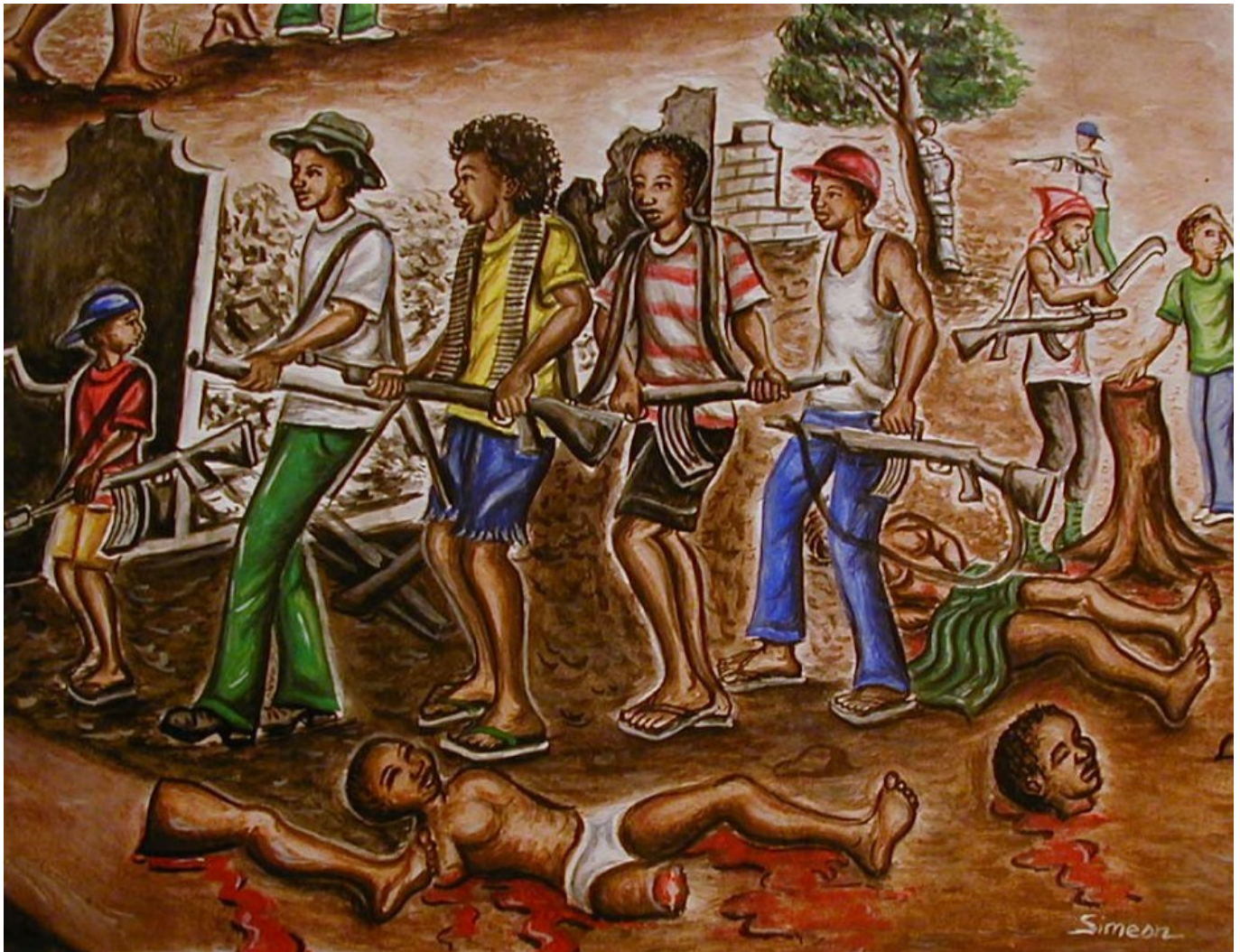
Simeon Benedict Sesay (Sierra Leone), Handiworks of Child Combatants , 2000.

The US attack on Venezuela on 3 January 2026 came on the same day as French and UK jets bombed an underground facility in the mountains near Palmyra (Syria) and just a few weeks after the US bombed villages in the Nigerian state of Sokoto. None of these attacks – all carried out under the pretence of fighting some form of ‘terrorism’ – had authorisation from the United Nations Security Council, making them violations of international law. These are all illustrations of the danger and decadence of this sulphurous hyper-imperialism. These are nothing more than instances of the NATO+ bloc demonstrating its power over the Global South through lethal military actions for which there is no defence.