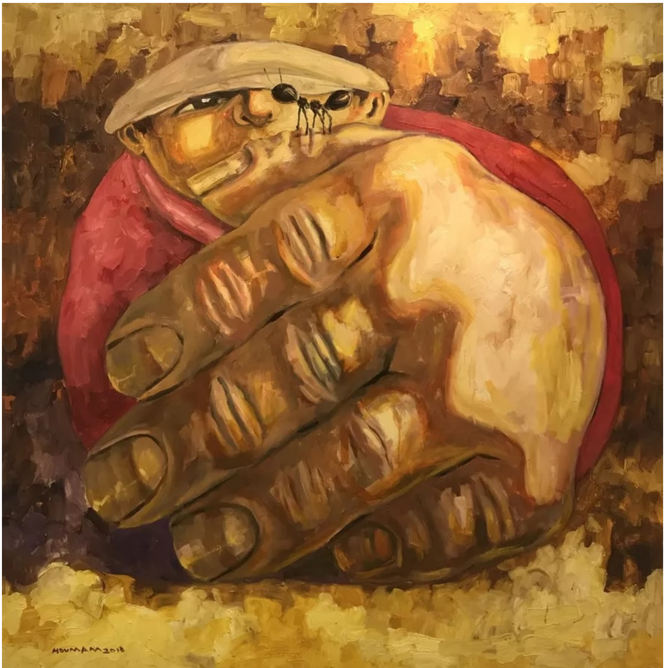
Houmam al-Sayed (Syria), Namle , 2012.