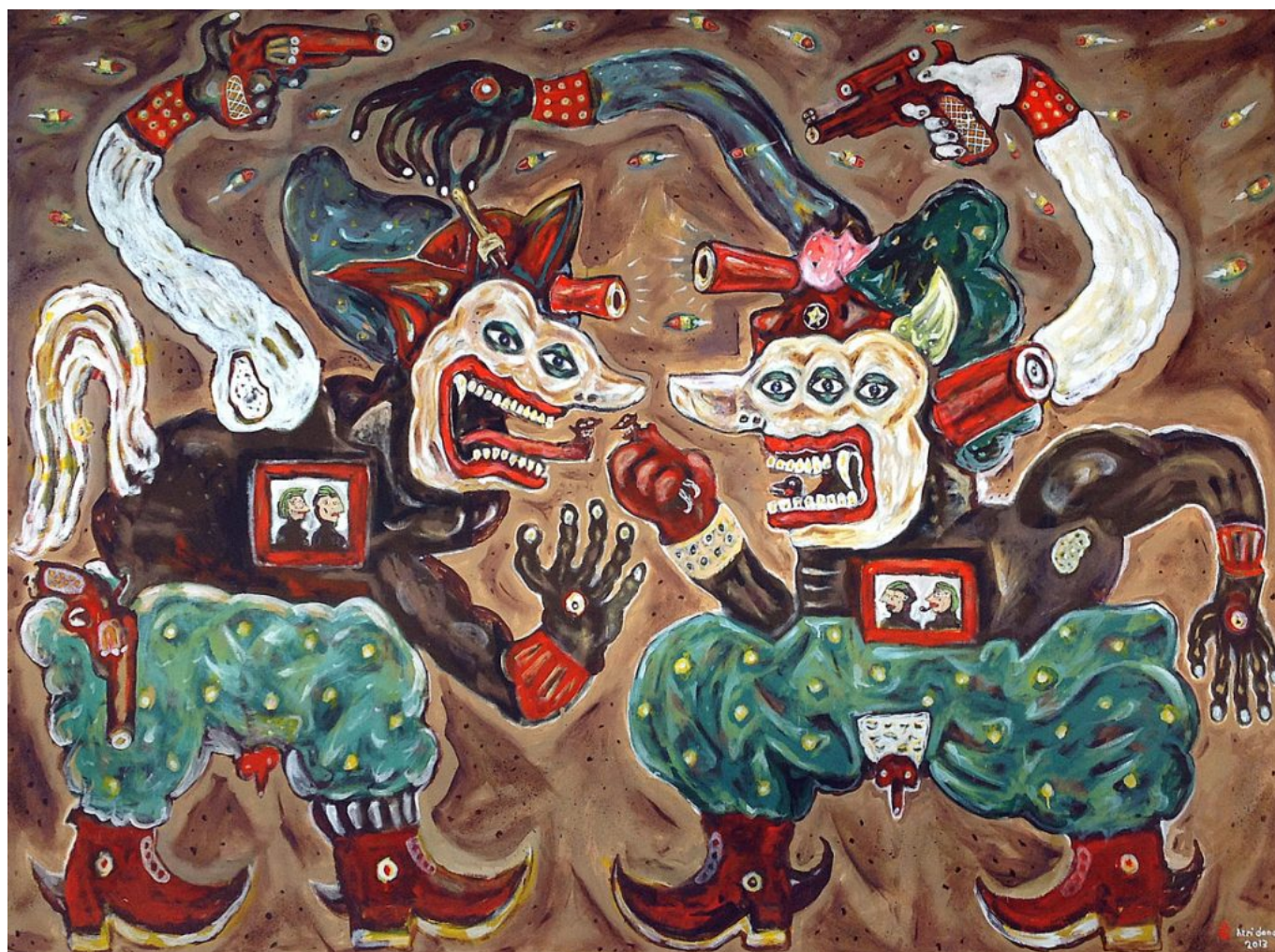
Heri Dono (Indonesia), Two Guards Who Protect Their Leaders , 2013.