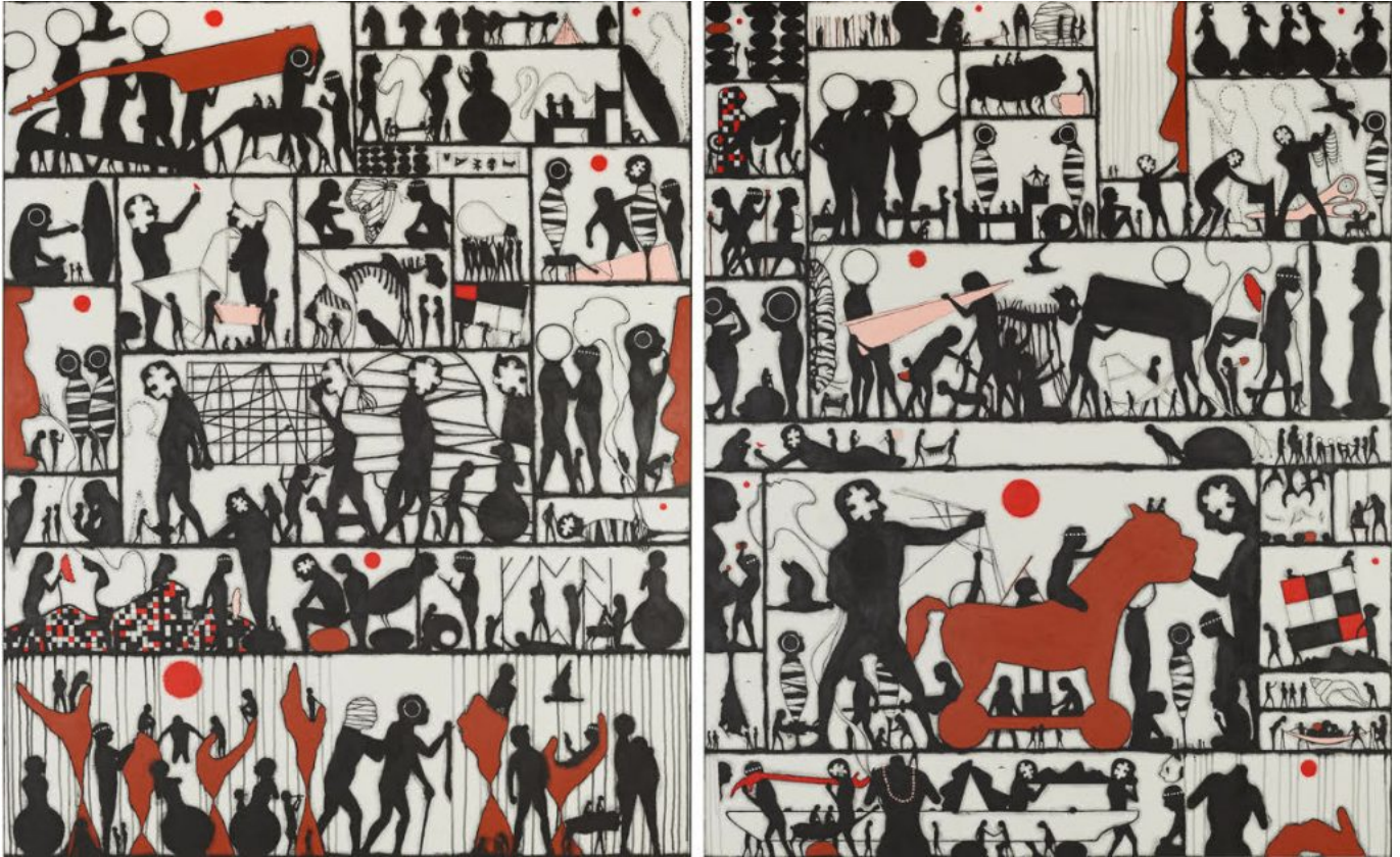
Andy Leleisi'uao (Aotearoa), Harmonic People , 2017.

maintaining a globe-spanning empire of over 900 military bases, investing $175 billion into the proxy war in Ukraine and $18 billion into Israel's genocide, and when the actual military spending stands at more than double the official figure – an astounding $1.5 trillion in 2022 alone. Trumpism, in all its paradoxical extremes of isolationism and belligerence, populism and nativism, is but another morbid symptom of this violent imperial decline.