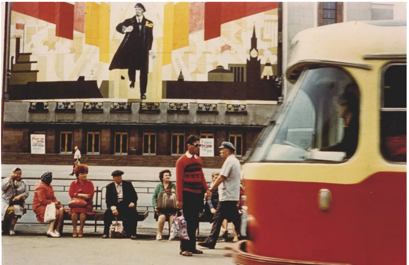
Boris Mikhailov (Ukraine SSR), Red , 1968-1975.