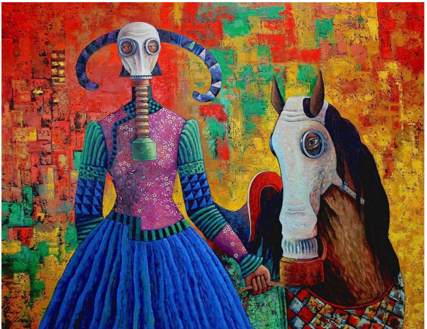
Zayasaikhan Sambuu (Mongolia), Survivors , 2013.

South amongst all classes. Yet, for the first time in decades, young Africans have come out to support the expulsion of French troops in Mali and Burkina Faso in West Africa. For the first time, the popular classes in Colombia were able to elect a new government that rejected the country's status as a vassal outpost of US military and intelligence forces. Working-class women are at the forefront of many critical battles of both the working class and society at large. Young people are rising up against the environmental crimes of capitalism. Growing numbers of the working class are identifying their struggles for peace, development, and justice as explicitly anti-imperialist. They are now able to see through the lies of US 'human rights' ideology , the destruction of the environment by Western energy and mining companies, and the violence of US hybrid war and sanctions.