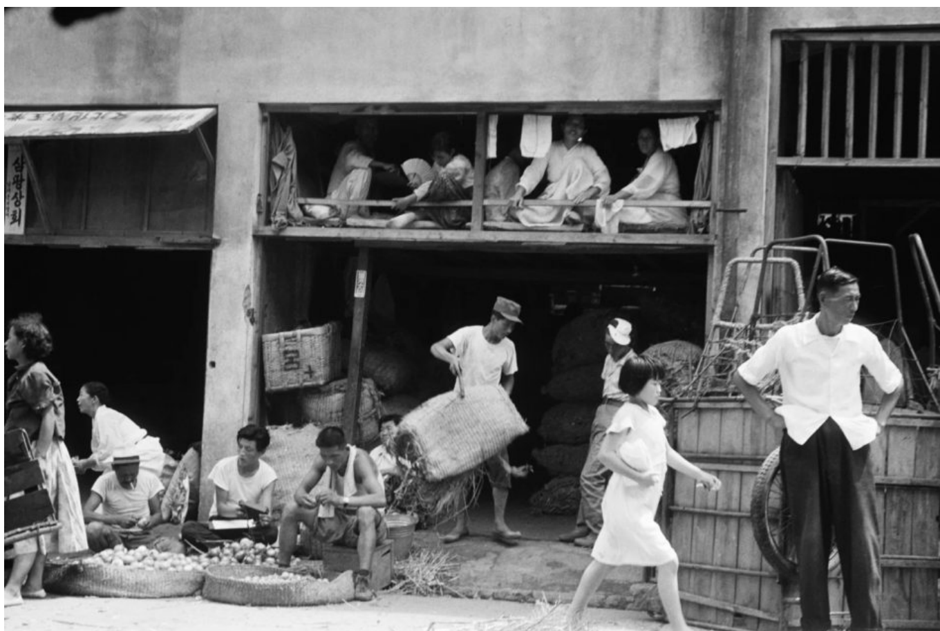
Han Youngsoo (Republic of Korea), Seoul, Korea 1956-1963.