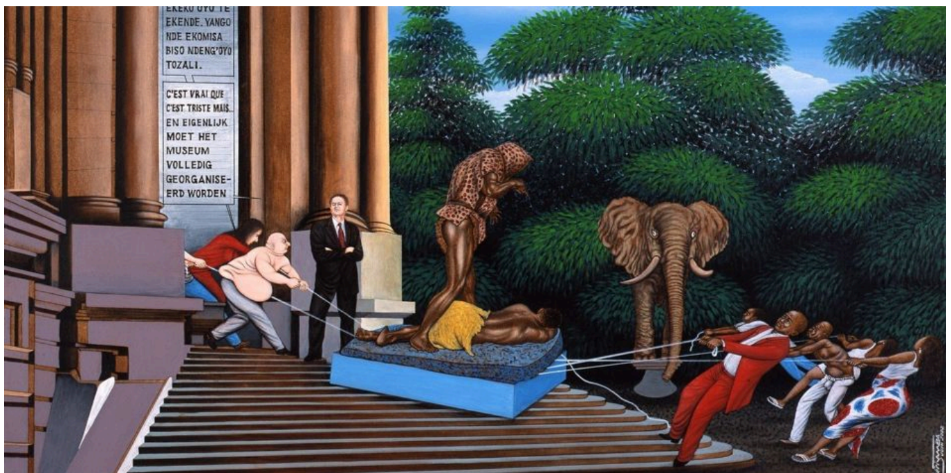
Chéri Samba (Democratic Republic of the Congo), Reorganisation , 2002.