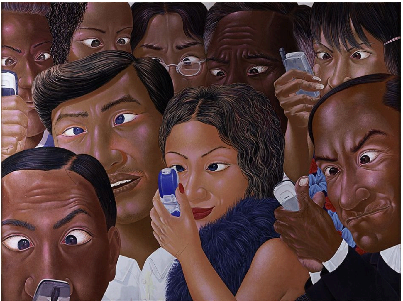
I. Nyoman Masriadi (Indonesia), Juling ('Cross-Eyed'), 2005.

adaptation, and investment, not through the empty conversation of the COP. Indonesia's deputy minister for environment and forestry management, Nani Hendriati, explained how the country would promote ecotourism in the mangrove forests through a ' blue carbon ' approach to ensure that tourism does not tear up the mangroves, seeking to halt the longstanding and rampant deforestation in the country (for example, 40% of Indonesia's vast mangrove system was destroyed between 1980 and 2005 alone). New initiatives in the country, for instance, promote crab farming in the mangroves rather than allowing their destruction. In this spirit, Indonesia's President Joko Widodo took world leaders to plant mangrove seeds in the Taman Hutan Raya Ngurah Rai Forest Park during the G20 meeting in Bali, Indonesia, which took place after COP27.