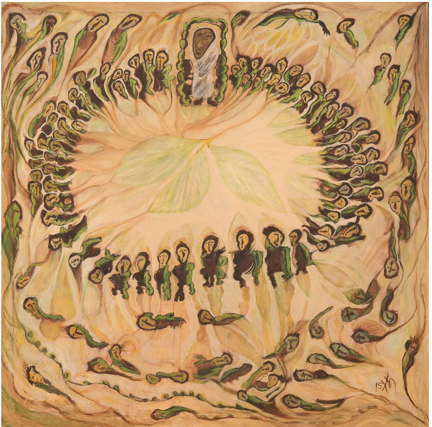
Kamala Ibrahim Ishaq (Sudan), Procession (the Zār) , 2015