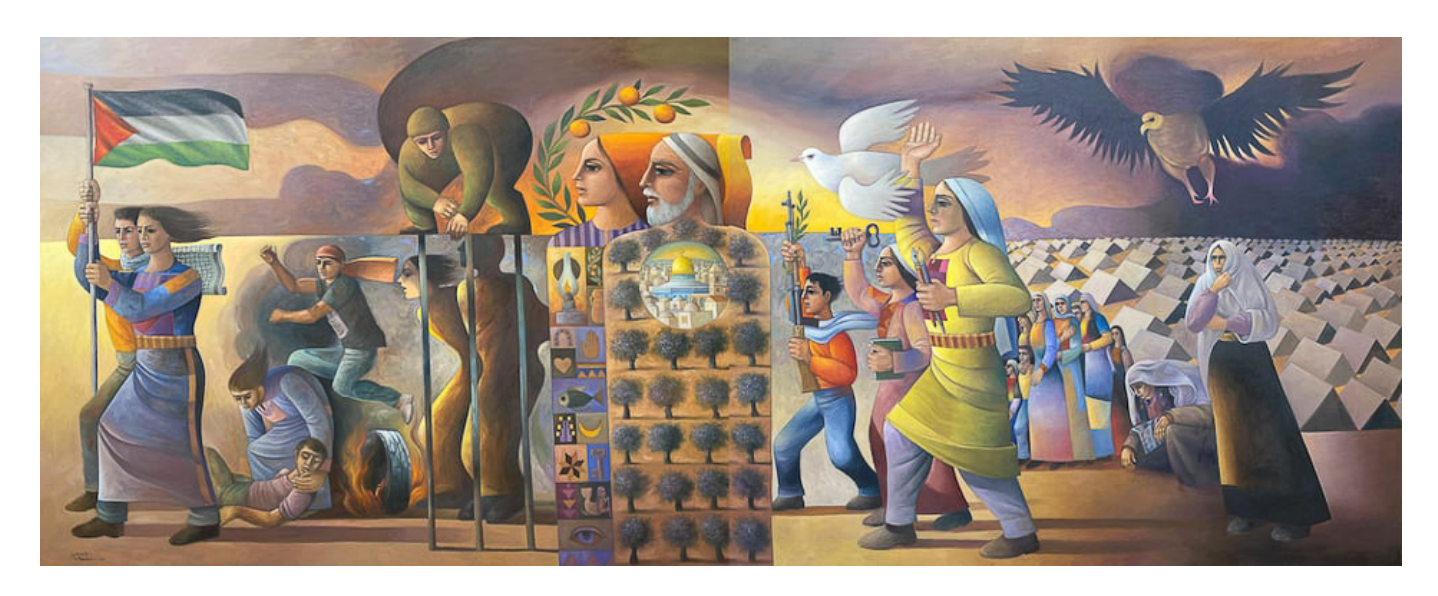
Sliman Mansour (Palestine), Revolution Was the Beginning , 2016.