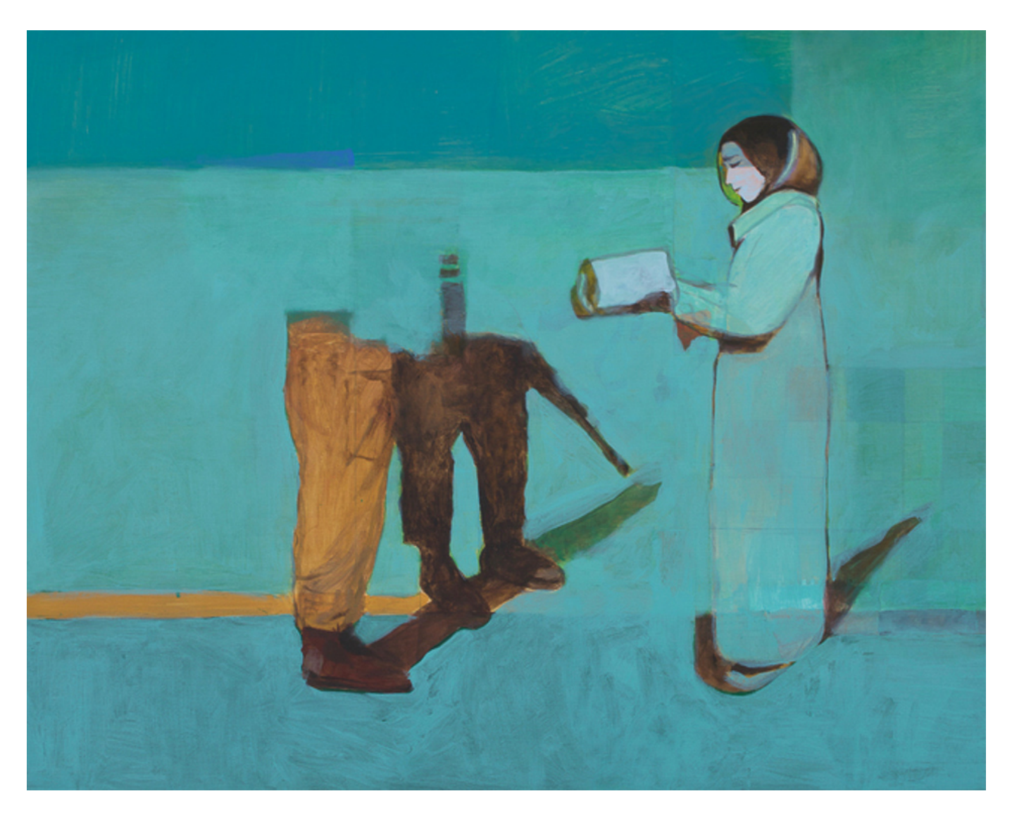
Khaled Hourani (Palestine), Suspicion, 2019.

The annexation of the West Bank will only deepen Israel's apartheid policies. The Zionist state will not permit Palestinians full citizenship rights. There is no intention to incorporate the Palestinian people into Israel with full citizenship nor to cede even a threadbare Palestine. This is barefaced colonialism of the old type. Inside this kind of colonial aggression comes the demolition of Palestinian neighbourhoods in East Jerusalem (such as Wadi Yasul ) and the destruction of olive groves (such as in Burin Village ). In the few months of 2020, the Israeli state has arrested 210 Palestinian children and 250 students, as well as 13 Palestinian journalists. These moves are reported by human rights groups and condemned by Palestinian civil society organisations but are otherwise ignored. This is the attrition of dignity.