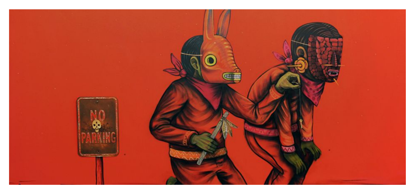
Edgar 'Saner' Flores (Mexico), Hijos del lago perdido ('Children of the lost lake'), 2017.

concentrated area of 1.6 million km<sup>2</sup> (roughly the size of Iran). Ultraviolet light from the sun degrades the debris into ' microplastics ', which cannot be cleaned up, and which disrupts food chains and ruins habitats. The dumping of industrial waste into the waters, including in rivers and other freshwater bodies, generates at least 1.4 million deaths annually from preventable diseases that are associated with pathogen-polluted drinking water.