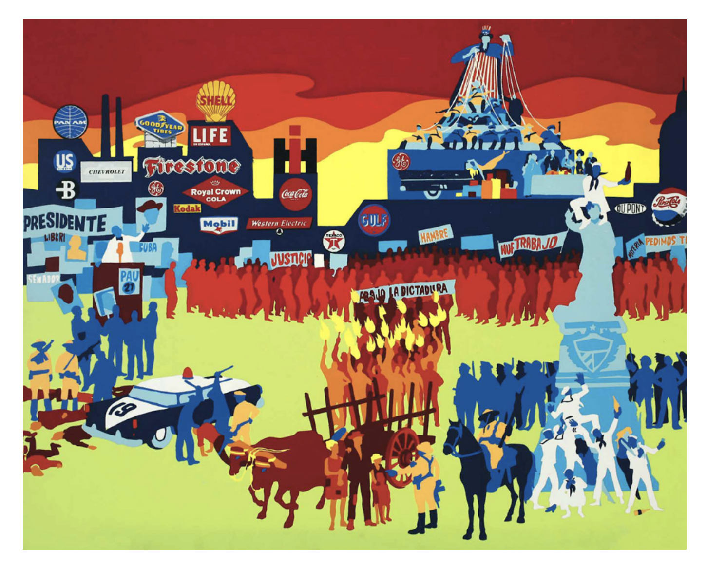
René Mederos Pazos (Cuba), Cuba 1952, 1973.

Ecosystem degradation is accelerated by capitalism, which intensifies pollution and waste, deforestation, landuse change and exploitation, and carbon-driven energy systems. For example, the Intergovernmental Panel on Climate Change's report , Climate Change and Land , (January 2020) notes that only 15% of known wetlands remain, most having been degraded beyond the possibility of recovery. In 2020, the UNEP documented that, from 2014 to 2017, coral reefs suffered from the longest severe bleaching event on record. Coral reefs are projected to decline dramatically as temperatures rise; if global warming rises to 1.5°C, only 10-30% of reefs will remain, and if global warming rises to 2°C, then less than 1% of reefs will remain.