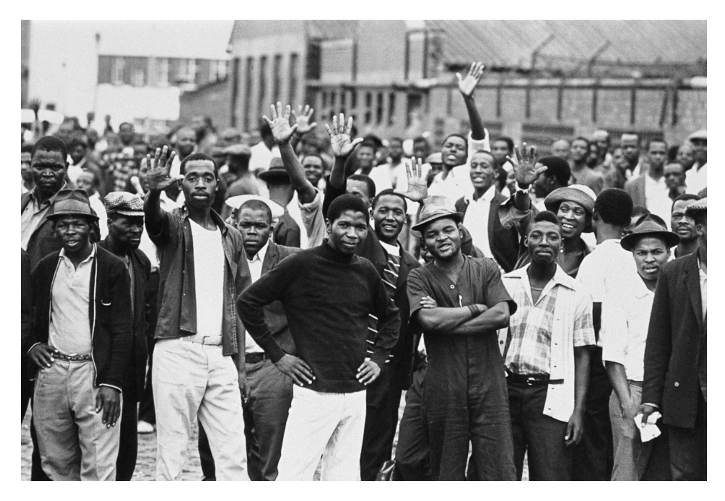
A group of striking textile workers demand an extra R5 per day at the Consolidated Textile Mill in February 1973.