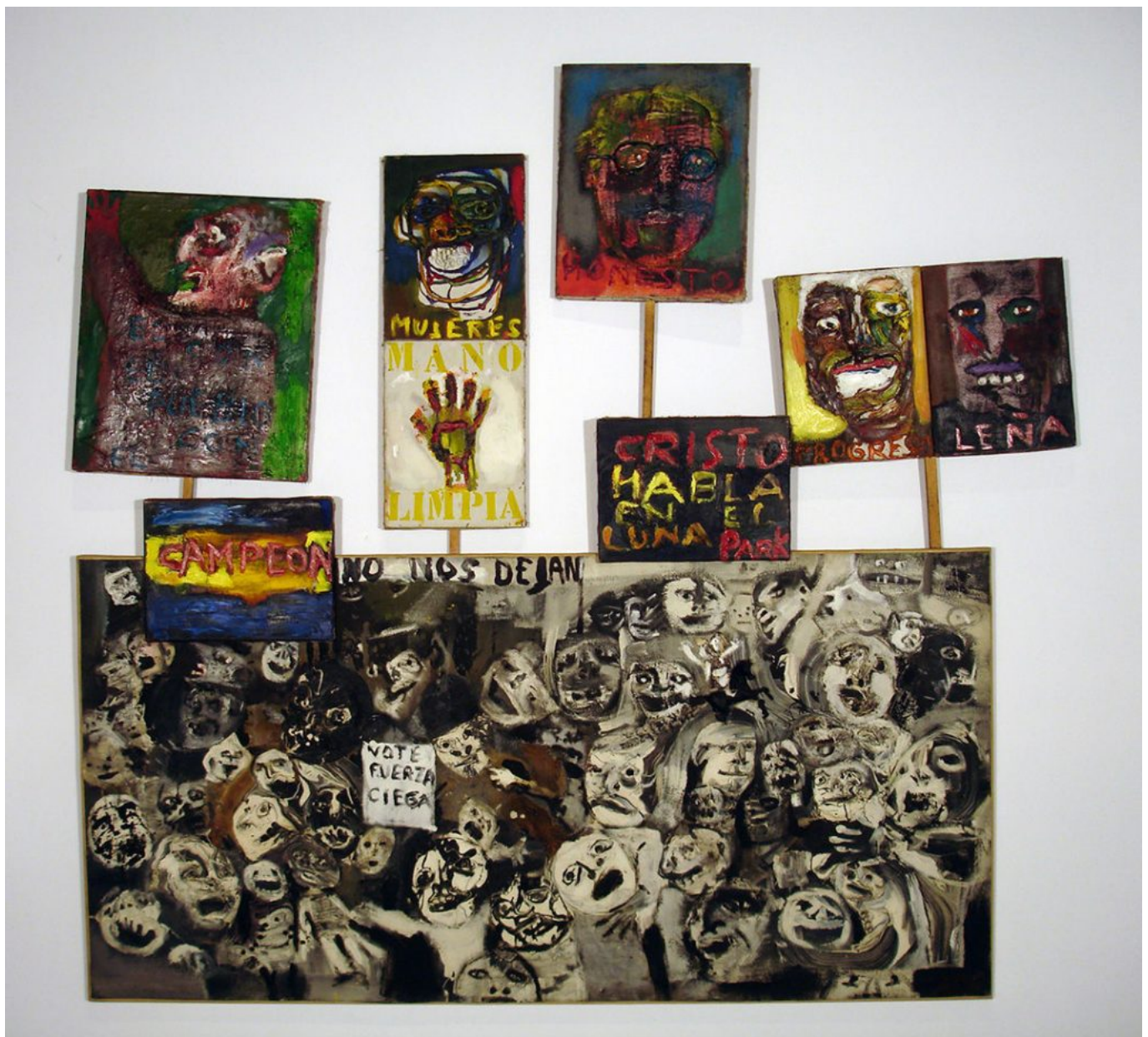
Luis Felipe Noé (Argentina), Introducción a la esperanza (Introduction to Hope), 1963.

Greetings from the Nuestra América Office of the Tricontinental Institute for Social Research,