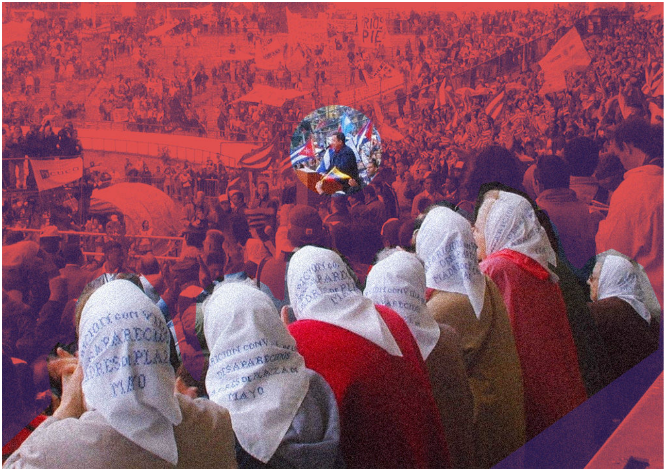
Discurso del Comandante Chávez en Mar del Plata (Speech by Commander Chávez in Mar del Plata), 2005. Visual intervention carried out by the Art Department, Tricontinental Nuestra América.

The NO to the FTAA was the seed for the creation of Union of South American Nations (UNASUR), for Argentina to cut ties with the IMF, for Evo Morales to expel the United States ambassador, for the birth of the Bolivarian Alliance for the Peoples of Our America – People’s Treaty of Commerce (ALBA-TCP) and ALBA Movements, for the creation of the Community of Latin American and Caribbean States (CELAC), for the regional pronouncement against the coup in Honduras in 2009, against the attempted coup against Correa in 2010, against the institutional coup against Lugo in 2013, and the strength of a region that in those years, working together, was able to regain a sovereign position, reduce poverty and inequality.