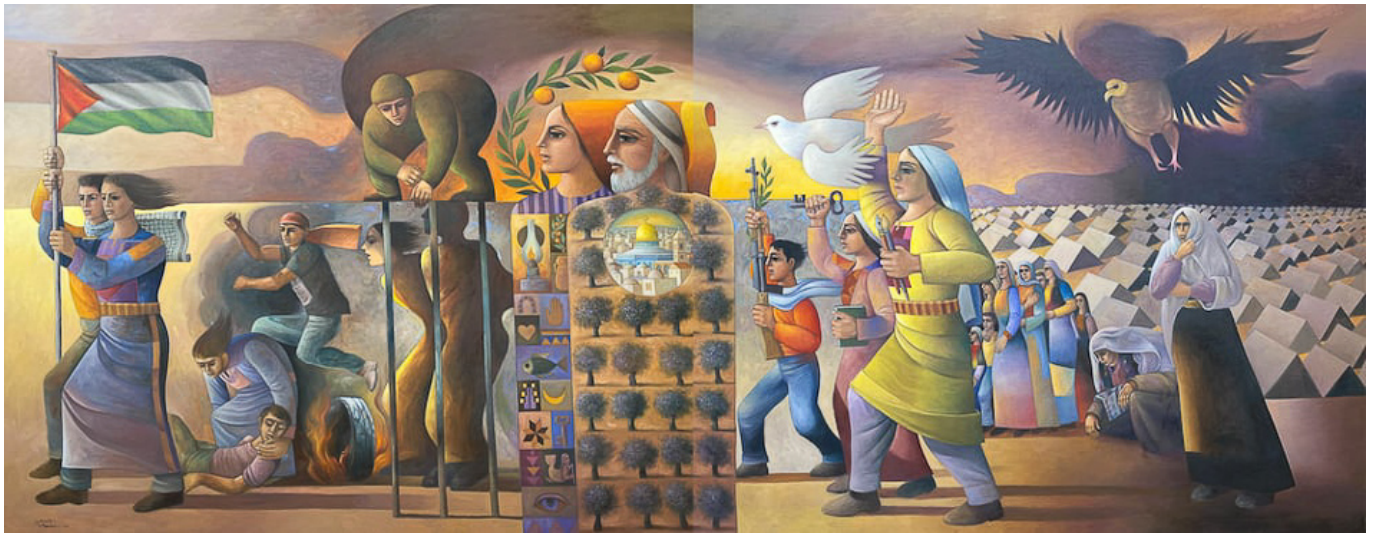
Image: Sliman Mansour (Palestine), Revolution Was the Beginning , 2016.

Sliman Mansour's 'Revolution Was the Beginning' is a painted landscape showing different scenes from the Palestinian life. On the extreme right, one can see refugee camps over which a dark cloudy sky looms. Two Palestinian women look on as younger groups of people and families march onwards in the hope for a better future; and the gloomy dark sky with a vulture symbolizing death transforms into a bright sun in which a dove flies in arms with a young girl. The three figures in the segment are holding three different symbols of Palestinian resistance; the boy holding a gun with an olive leaf, a woman holding a key symbolizing an imminent return of the Palestinian people to their homeland after the mass exodus, and the woman in front holding a brush and a pen symbolizing the intellectual, artistic lineages of the Palestinian struggle.