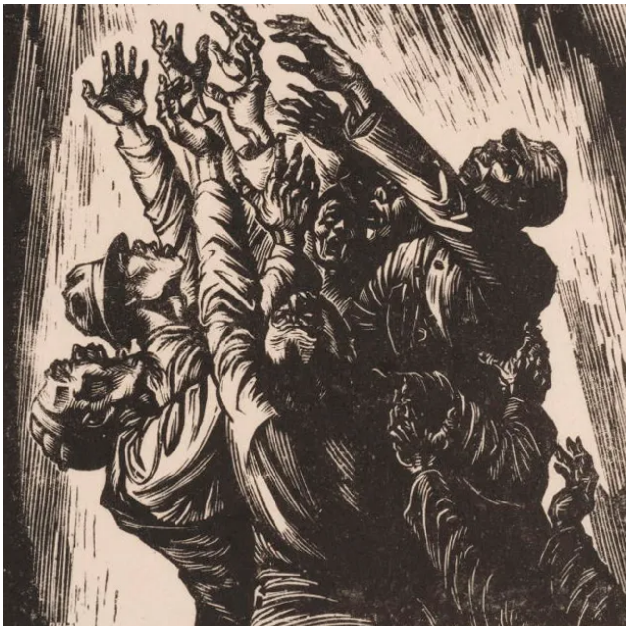
Li Hua (China), Pursuit of Light , 1944.

On 3 September, China commemorated the eightieth anniversary of its victory in the Chinese People’s War of Resistance Against Japanese Aggression and the World Anti-Fascist War with a massive parade in Beijing. ‘Serve the people!’ roared the over 10,000 military personnel as President Xi Jinping made his rounds in the Hongqi convoy, followed by a display of the People’s Liberation Army’s modernised system of military arms and services. The celebrations were attended by twenty-six foreign leaders, including Russia’s President Vladimir Putin and Kim Jong Un of the Democratic People’s Republic of Korea. This was followed by a series of high-level discussions, including with Cuba’s President Miguel Díaz-Canel, in which China affirmed its continued support for Cuba and its fight for sovereignty and dignity.