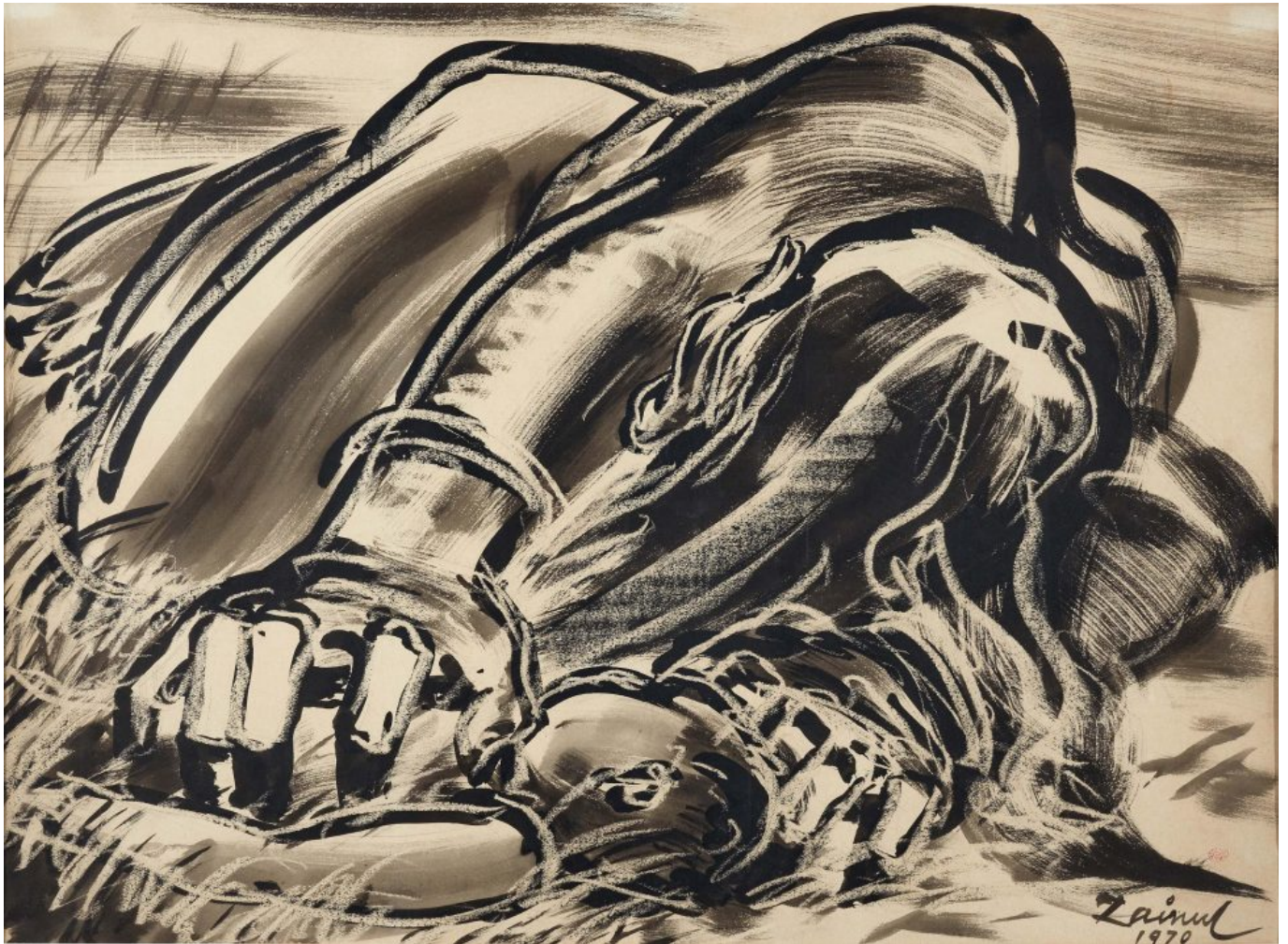
Zainul Abedin (Bangladesh), Untitled , 1944.