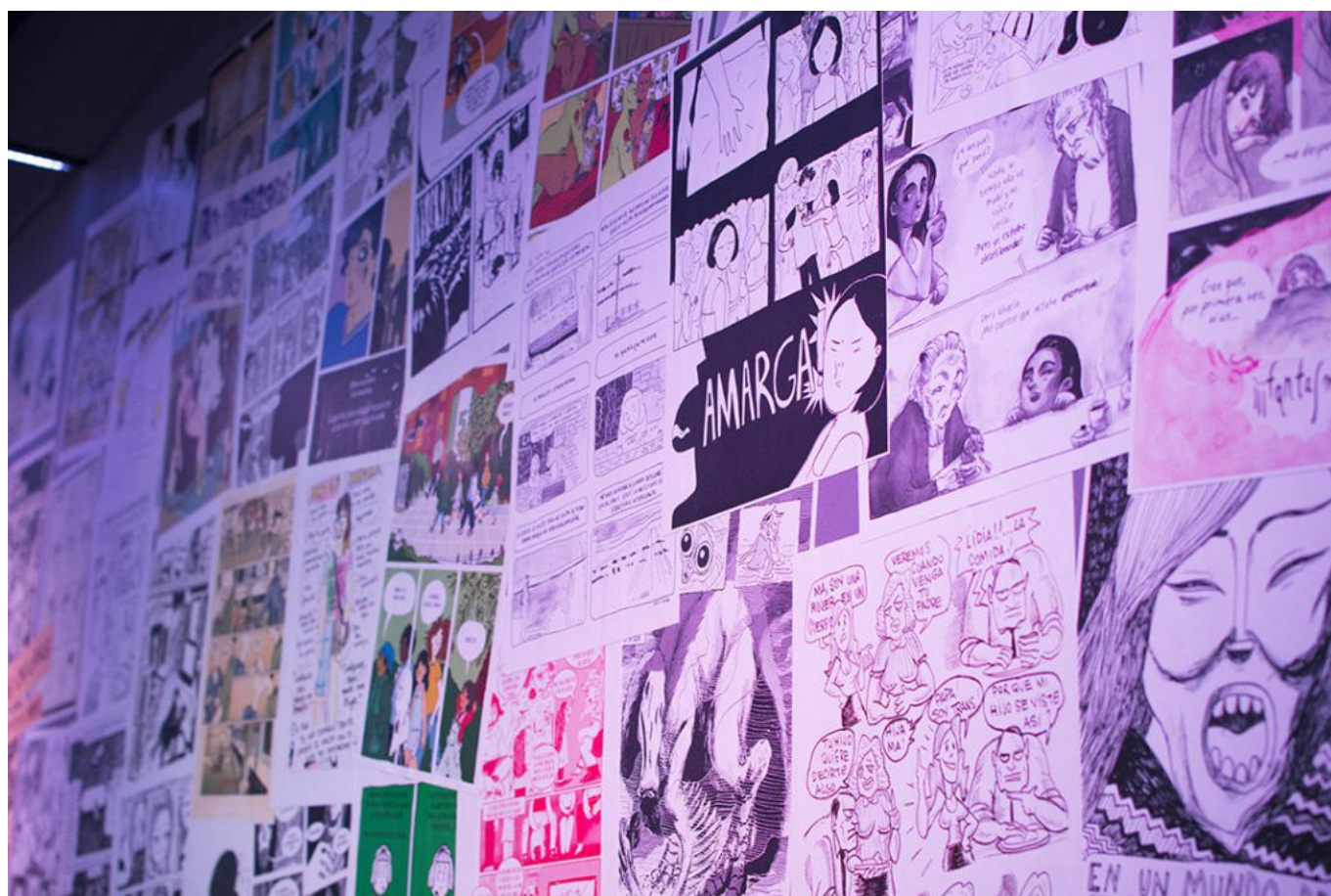
Feminismo Gráfico exhibition at the Feria de Editores, Buenos Aires, 2025.